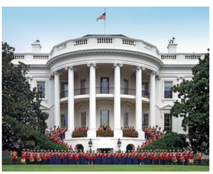
Now in its third century, the Marine Band (above) received the title The President's Own from Thomas Jefferson.