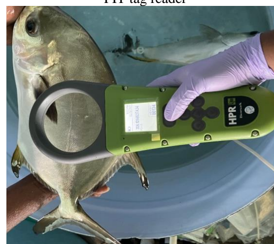
Reading the PIT tag in brooder fish

Usually, intramuscular insertion is preferential (below the muscular region of the dorsal fin) for brooders. In standard cases, pit tag causes no mortality and few incidents of infection. The maturation stages of the fish can be assessed by cannulation of the particular fish and recorded in the particular fish's register. Each tag represents a specific number which can be recorded in a register along with the growth measurements (and maturity stages) of the fish. After a definite period, fish can be recaptured, and pit tag reading can be used to identify the particular fish. Various studies confirmed that pit tagging wouldn't cause any severe impact on the survival or growth of the fish in hatchery conditions.