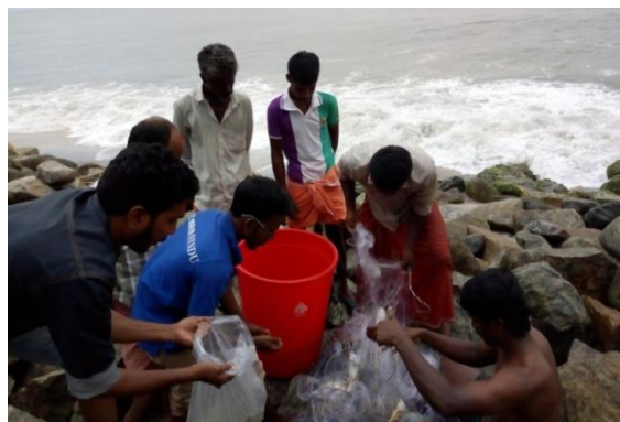
Fishes removing from the gill net operated off Alappuzha coast, Kerala, India*

Sub-adults or adults of fish can often be captured by hook and line in some areas where trawling like practices are not possible. Non-trawlable fishing grounds of coastal