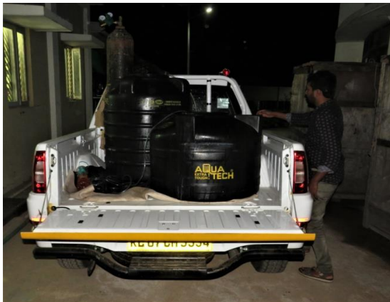
(a) Transporting vehicle with two holding tanks, oxygen cylinder and air pump