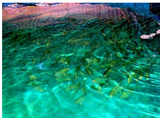
Brooder fishes in maturation tanks

Seawater used in the facility should enter a storage tank and be treated with a hypochlorite solution. Water quality requirements in the maturation tank system are a temperature of 27–29 °C, a salinity of 27–32 ppt, ammonia of \leq 0.02 and a pH of 7.8–8.5, permitting adequate feeding of the broodstock while maintaining optimal and stable water quality.