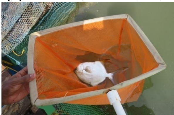
Handling using fine mesh net

Handling brood fishes during the collection process should be minimum to prevent physical injury and physiological stress. Damage to the slime (mucus) layer, scales, and skin of the fish can result in infection, leading to secondary infection and mortality after the transportation. Knitted fine-mesh dip nets are recommended for handling fish to minimize injury and scale loss (Rottman et al. , 1991).