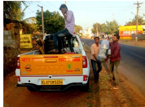
Plastic bag with brood fish loading to the vehicle

In the tank method of transportation, one holding tank of Fibre glass or triple layered plastic tanks (Aquatech, India) of suitable capacity like 250 or 500 or 1000 L (according to the quantity needed to transport and capacity of the vehicle), Oxygen cylinder and a small air pump (battery operated) can be used to transport the fish. Tanks should be aerated. The tank should be equipped with pure oxygen regulated to maintain dissolved oxygen concentrations at a minimum of 7 ppm (Kohler, 1997). A portable generator of 220-240 Voltage can be used as standby equipment to avoid critical conditions like air cut-off. Warm water also reduces available oxygen and increases the metabolic rate of the fish, adding further physiological stress. The stocking density of fish is a critical factor which determines the survival of the brood fishes. A stocking density of 100 g/50 L is advisable for transporting marine fish. Transporting the fish during the early morning hours or night hours is advisable to avoid the temperature hike from sunlight. Ice blocks wrapped in plastic cover may be added to the holding tank during transportation to prevent an increase in water temperature.