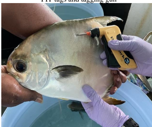
PIT tagging of brooder fish