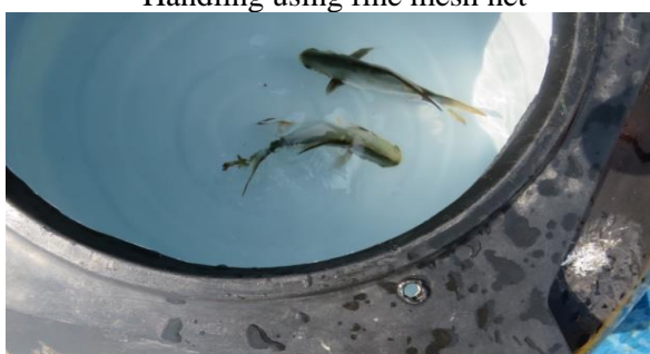
Fishes inside the tank