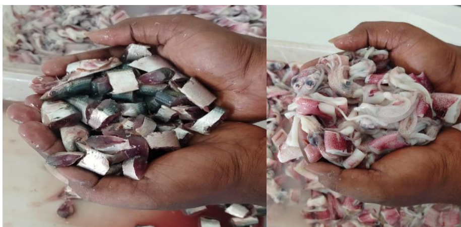
Trash fish and squid ready to feed broodstock

Newly collected fish should not be fed until all therapeutic treatments are completed. This delay assures the fish will be hungry when feed is first offered, and prevents habituating fish from ignoring feed by presenting it to them when stress or disease agents impede their appetites (Kohler, 1997). Initially, fish can be fed with squid and trash fish by hand feeding. After a period of one month, mix squid meat (better to keep the formulated feed inside the end portion of squid) with formulated feed and train them to accept it.