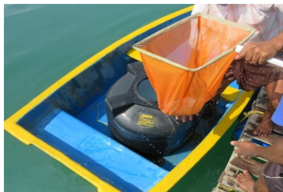
Transferring to holding tank,