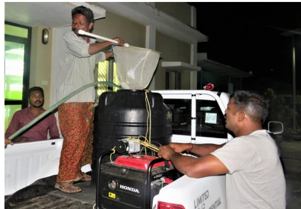
(b) unloading the fish to the quarantine section in the hatchery.