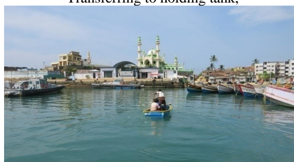
Holding tank with fish transporting to the vehicle