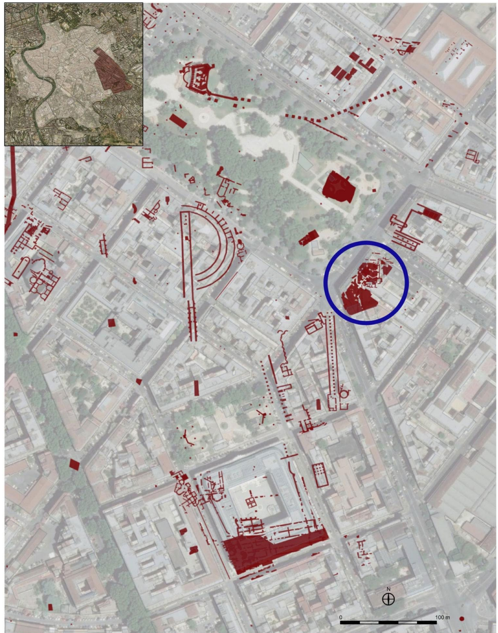
Fig. 1 Horti Lamiani (Esquiline Hill, Rome). Archaeological evidence of the Horti Lamiani structures (in red) on the aerial view of the modern city of Rome (data from SITAR - Sistema Informativo Territoriale Archeologico di Roma; https://www.archeositarproject.it/ ). The blue circle indicates the area excavated since 2006 from which the studied samples came. Inset, modern Rome within the Servian Walls (in light colour) with location of the Esquiline Hill (red area)

accumulations of tuff stones on the bottom for drainage and to prevent waterlogging of roots. Later, during the age of Tiberius and Caligula (Phase 3.2, 14–41 CE), a new terrace and a marble staircase were added to the original layout of the garden. These changes are associated with the creation of an irrigation system using lead pipes, connected with the cultivation of new plants which in some cases coexisted with those of the previous phase. Of particular interest is an arrangement of circular and square holes for plants, 0.05–0.2 m wide and 0.1–0.25 m deep, arranged individually or in double rows parallel to the terrace walls and about 0.8–1 m from them. Single smaller holes set closer together were found close to some of the walls, suggesting the presence of different types of plants in the garden. Several ollae