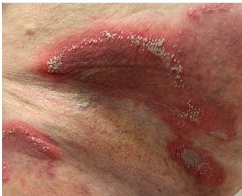
Figure 6. Subcorneal Pustular Dermatitis (courtesy of Dr. Dastoli).