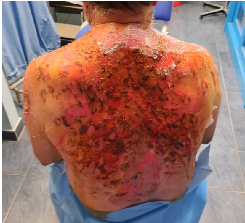
Figure 5. Pemphigus.

Pemphigus is a group of autoimmune diseases characterized by the formation of erosions and/or flaccid bullae of the skin and/or mucosae (Figure 5). All variants of pemphigus are characterized by the development of autoantibodies to the desmosomal proteins of the epidermis [156]. An Israeli group reported treating two cases of IgA pemphigus with 0.5 mg of colchicine three times per day, with the resolution of the condition in two weeks. [157]. A Japanese group used colchicine and a topical steroid in the treatment of pemphigus foliaceus, with good results [158].