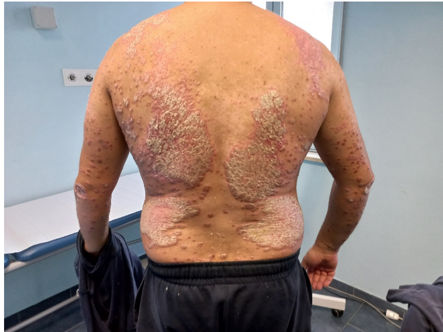
Figure 3. Plaque psoriasis.