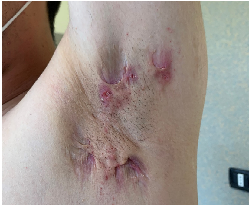
Figure 4. Hidradenitis Suppurativa (courtesy of Dr. Dastoli).

scoring system, and the Dermatology Life Quality Index. All the patients showed an improvement in all the scores after 3 months of treatment and continued to improve over time, suggesting colchicine as a good agent in combination therapy [51]. A Greek study divided 44 patients into three groups, where the first group received 1 mg per day of colchicine as monotherapy, the second group received both colchicine and doxycycline at 100 mg per day, and the third group received both colchicine and doxycycline at 40 mg per day. The three groups reported an improvement in all measured scores, but there was no statistically significant difference among the groups [52].