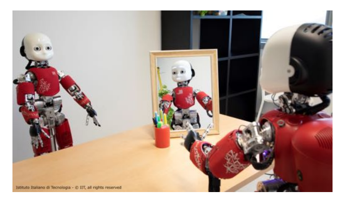
Figure 1: Two iCub robots. One looking in a mirror and recognizing being different from the other iCub.

Previous studies on this topic have mainly relied on Theory of Mind as a paradigm to investigate such query. Theory of Mind (ToM) [1] is the ability to attribute mental states to others and it has been found that humans use the same mechanism to attribute beliefs and intentions to robots by assigning them human-like traits or characteristics [6, 10, 28, 30]. Theory of Mind refers to the capacity to infer others' mental states: it is the ability of reasoning on the