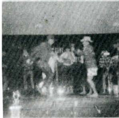
KAPPA DELTA WASHBOARD JAMBOREE

Lambda Chi set the stage for a great year with the first place award in the Chi Omega's November Nonsense. The theme dealt with the criticism of American institutions and our entry was entitled "A Dying Business", a spoof on the American funeral. As in the best of Chopper tradition, song, dance and a bit of burlesque brought the trophy home. Although several greek acts aroused criticism among groups, "A Dying Business" was congratulated as a "Professional Performance" by the COLLEGE HEIGHTS HERALD.