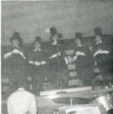
CHI OMEGA'S NOVEMBER NONSENSE

Lambda Chi set the stage for a great year with the first place award in the Chi Omega's November Nonsense. The theme dealt with the criticism of American institutions and our entry was entitled "A Dying Business", a spoof on the American funeral. As in the best of Chopper tradition, song, dance and a bit of burlesque brought the trophy home. Although several greek acts aroused criticism among groups, "A Dying Business" was congratulated as a "Professional Performance" by the COLLEGE HEIGHTS HERALD.