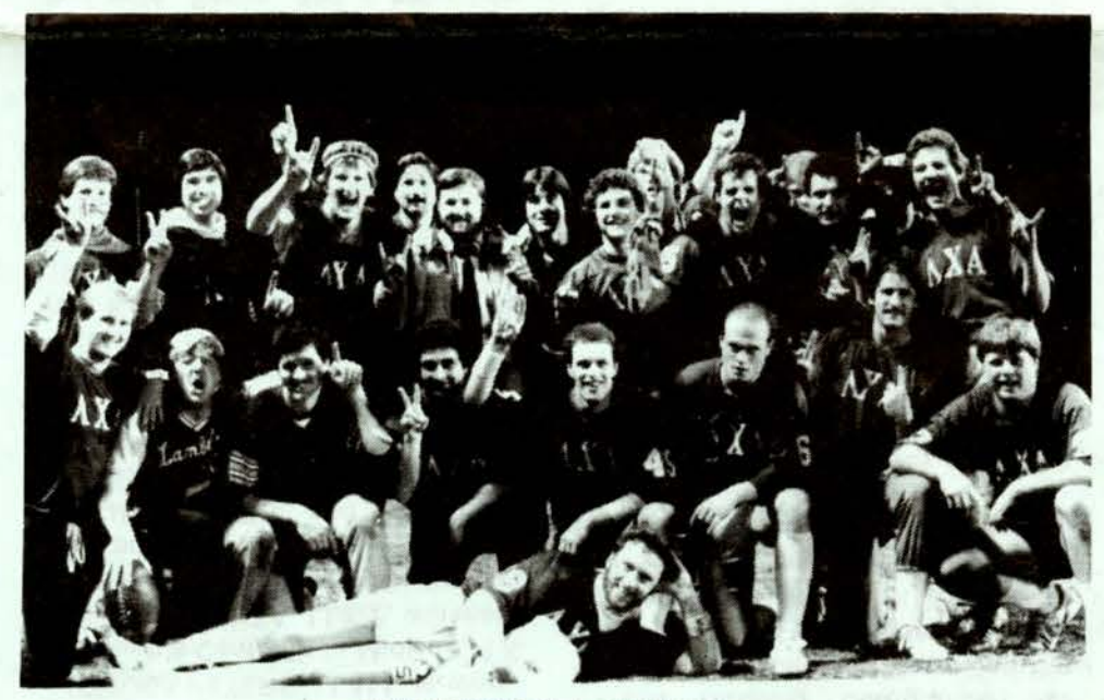
1982 FOOTBALL CHAMPS