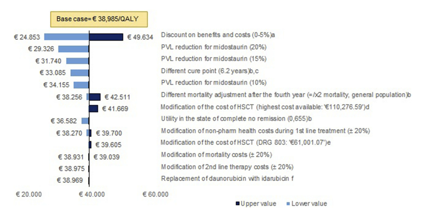
Figure 2 Univariate sensitivity analysis. a. Based on economic evaluation guidelines. b. Based on NICE recommendations. c. In keeping with the follow-up time in the RATIFY study. d. The highest cost of allogeneic HSCT found in the available evidence (eSalud). e. Cost of HSCT equivalent to the cost of DRG 803 ("Allogenic bone marrow transplantation"). f. Based on expert opinion.

Abbreviations: AE, adverse events; PVL, ex-factory price.