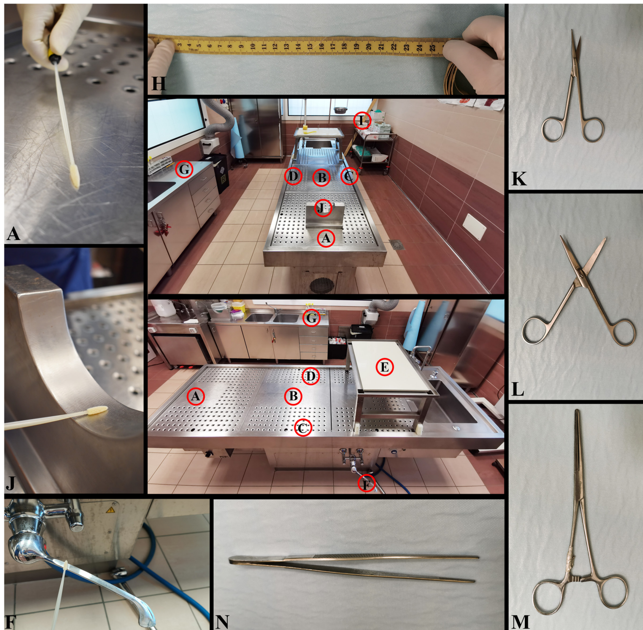
FIGURE 1 Surfaces and instruments sampled at the postmortem facility. A: autopsy table at the head level; B: autopsy table at the buttocks level; C: autopsy table at the right-hand level; D: autopsy table at the left-hand level; E: removable table; F: water tap; G: side table; H: measuring tape; I: glove box; J: head/neck support; K: coronary artery scissors; L: large-size scissors; M: Kocher; N: forceps. [Color figure can be viewed at wileyonlinelibrary.com ]

techniques achieved in the last years [11]. The median human DNA content of the whole sample was 0.007 ng/ \mu l (IQ = 0.136–0.000). Detailed results for surfaces and instruments are shown in Table 2 and Figure 2.