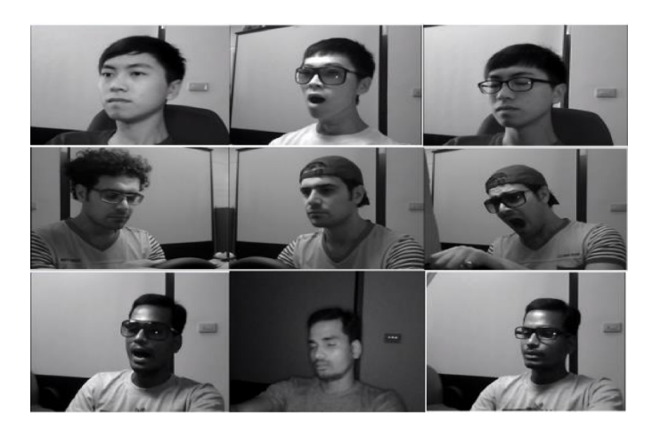
Fig. 1. NTHU Dataset Sample Images