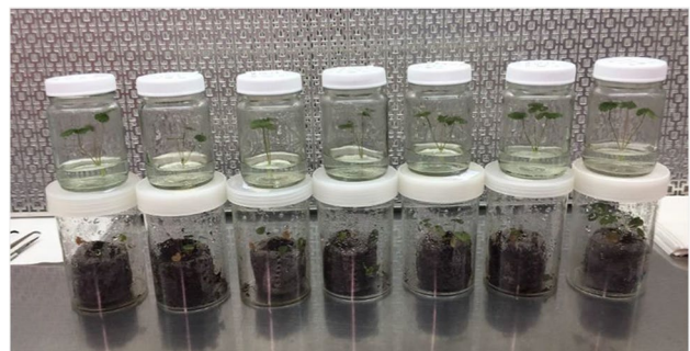
Figure 1. Strawberry ( Fragaria × ananassa Duch.) plants cultured in Murashige and Skoog medium ( top ) and peat ( bottom ).

Four mo after sub-culturing into their treatment substrates, half of the plants in each treatment were destructively sampled to evaluate plant growth and health, determined by plant weight, leaf color, leaf number, and root development. Survival and dry weight (after incubation at 60 °C for 24 h) were also recorded. The remaining plants were transferred ex vitro into Uncut Kwik Pot 42 Cell Trays (cell dimensions: 45mm L × 45mm W × 75mm D) containing steam-sterilized river sand and coir (1:1) seedling mix supplemented with standard fertilizer Scotts Osmocote® (Osmocote Exact Standard, Heerlem, Netherlands) at approximately 30 g per tray. The trays were placed under two layers of shade cloth in a glasshouse. After 1 wk, plants were hardened off by gradually removing one layer of shade cloth, and at 2 wk covers were completely removed. One mo after planting into trays, plants from both treatments were evaluated on leaf and shoot numbers produced, and root development.