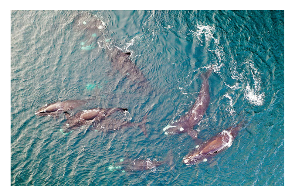
Fig. 20.2 A group of ten socializing southern right whales photographed by drone in the Auckland Islands Maungahuka in the Aotearoa New Zealand subantarctic by the University of Auckland Waipapa Taumata Rau southern right whale research team, under New Zealand Department of Conservation permit 84845-MAR

Although aggregations of several males within temporary group formations are most likely driven by intra-sexual selection among males, they may also offer females the possibility to assess multiple potential mates. In North Atlantic right whales and humpback whales, females may facilitate the formation or increase the size of male aggregations to incite competition among males by surface-active displays (Clapham 2000) or vocalizations (Kraus and Hatch 2001; Parks 2003; Parks and Tyack 2005; Parks et al. 2007). Females may thus use aggregations of competing males to secure the highest quality male by mating with (or being fertilized by, see Sect. 20.2.3) the winner of the competition or through active mate choice.