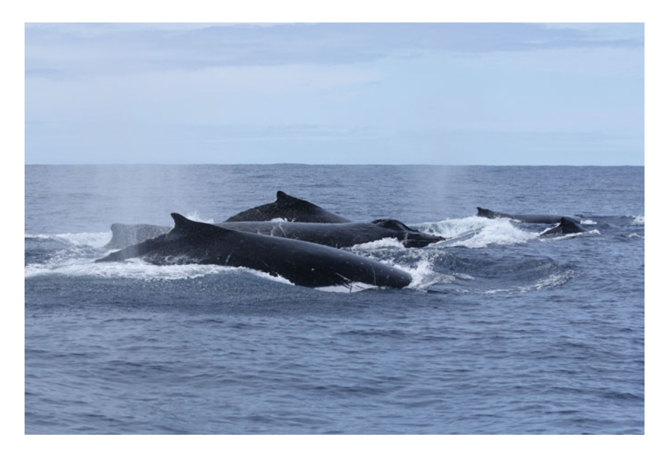
Fig. 20.3 Humpback whale competitive group on their breeding grounds off the coast of New Caledonia in the South Pacific. The photo was taken by Opération Cétacéas, under a permit issued by the Province Sud

considering the hours-long duration of competitive group formations. Interestingly, mature-sized females at times have a preference for large males (Pack et al. 2012), suggesting that sexual selection could still favor large body size in males through female mate choice. Large male body size may convey other advantages, such as large offspring size, which has been correlated with low mortality in the first year of life in southern right whales (Best and Rüther 1992). Considering the atypical mammalian sexual dimorphism in mysticetes, where females tend to be slightly larger than males, selective pressures for large body size in females resulting from their higher energetic demands for reproduction likely outweigh sexual selection pressures for large body size in males (Ralls 1976).