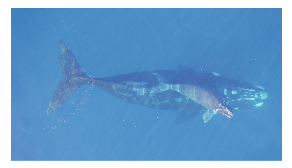
Fig. 20.1 Southern right whale cow-calf pair, photo taken in the Auckland Islands Maungahuka in the Aotearoa New Zealand subantarctic by the University of Auckland Waipapa Taumata Rau southern right whale research team, under New Zealand Department of Conservation permit 84845-MAR