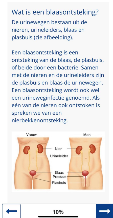
Fig. 3 Screenshot of an e-learning module. Patients can navigate using the arrows at the bottom. The written information is also visualized using images or videos

cranberry supplements, genital soap use, condom use, post-coital voiding, and taking sufficient time to void). Participants recorded these topics in the app as part of a baseline assessment. Lifestyles were scored on five-point Likert scales ranging from never to always.