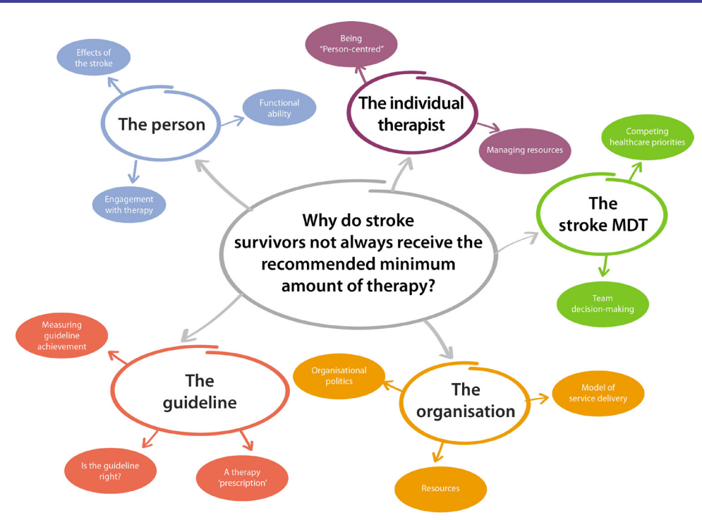
Figure 1 Graphical representation of focus groups' themes and subthemes. MDT, multidisciplinary team.

Other research literature supports the perception that low mood and lack of motivation may reduce the amount of therapy a person received after stroke,<sup>21 35 38</sup> and that low mood is common after stroke.<sup>39 40</sup>