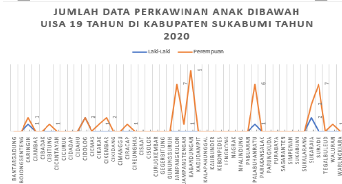
Diagrams 1. 2 Total Data on Child Marriage in Sukabumi Regency in 2020

Based on diagram 1.2 above, it can be interpreted that there were 45 child marriages that occurred in Sukabumi Regency in 2020, with details of 6 boys and 39 girls. Most child marriages occurred in the Kabandungan District with 9 women who were recorded as having married under the age of 19 and then in the Jampang Kulon and Surade sub-districts with 7 women who were registered as having married children. The number of child marriages in 2021 in Sukabumi Regency is shown in the following diagram: