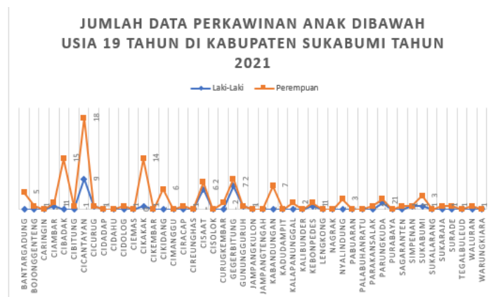
Diagram 1. 3 Total Data on Child Marriage in Sukabumi Regency in 2021

Based on diagram 1.3 above, it can be explained that there are 122 child marriages in Sukabumi Regency in 2021 recorded at the Ministry of Religion of Sukabumi Regency, with details of 31 men and 91 women. Child marriages that were recorded at the Ministry of Religion of Sukabumi Regency mostly occurred in Cicantayan District with a total of 27 people and then in Cikakak and Cibadak Districts with a total of 15 people. Marriages of children under the age of 19 recorded at the Ministry of Religion have increased significantly from the