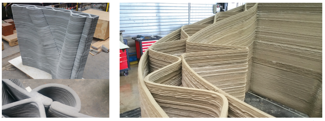
FIGURE 2 UHPC 3D printing. From: C. Gosselin, R. Duballet, P. Roux, N. Gaudillière, J. Dirrenberger ans P. Morel, Large-scale 3D printing of ultra-high performance concrete-a new processing route for architects and builders, Materials and Design, vol. 100, pp. 102-109, 2016. and XtreeE, http://www.xtreee.com

The DEMOCRITE project was designed upon the following challenge: developing a large-scale additive manufacturing technology capable of producing multifunctional structural elements with increased performance. With this work, the aim of our group was also to take part in the redefinition of architecture and design in the light of integral computation and fully automated processes. The results of the DEMOCRITE project, including tangential continuity slicing, optimization for low thermal conductivity, as well as actual built structural elements, were published in Materials & Design<sup>7</sup>. An example of the structures developed and printed in DEMOCRITE is shown on Fig.2, along with a more recent construction by XtreeE<sup>8</sup>. As a continuation of the project, a spin-off company, XtreeE, was created in order to develop and commercialise the 3D printing technology introduced.