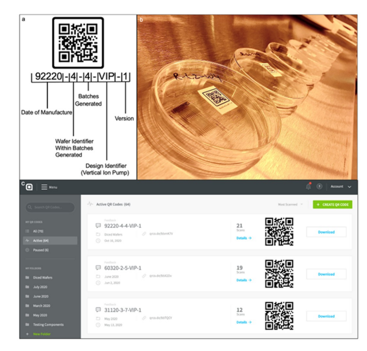
Fig 2. QR code tracking system. (a) A detailed breakdown of the unique identifier's nomenclature that is tied to a QR Code, and (b) label device container with unique identifier and QR Code. (c) User interface subscription-based desktop application used to generate QR Code. Fig 2C provided through courtesy of QR Code Generator.

The QR code system tracks data that has been separated into categories to keep the information organized (Fig 3). Batch info provides the researcher with general data such as batch number, initial fabrication location, substrate material, fabricator name, etc. (Fig 3A). For example, Fig 3A lets the researcher know that wafer 92220-4-4-VIP-1 was initially fabricated