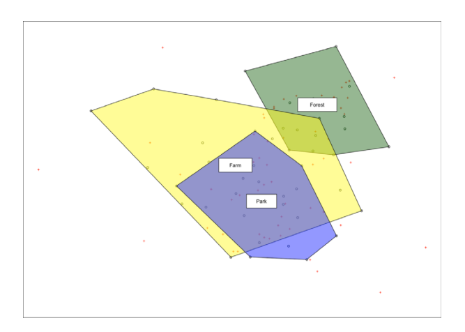
FIGURE 2 Plot of Non-metric multidimensional scaling (NMDS) ordination of presence/absence data. Species are red crosses, and locations are black circles. Blue (park), green (forest) and yellow (farm) polygon overlays represent the three different habitat types. Stress = 0.2.

Across the environmental factors investigated, plant species richness showed the strongest effect on ant species richness. We found ant and plant species richness to be positively correlated. Plant