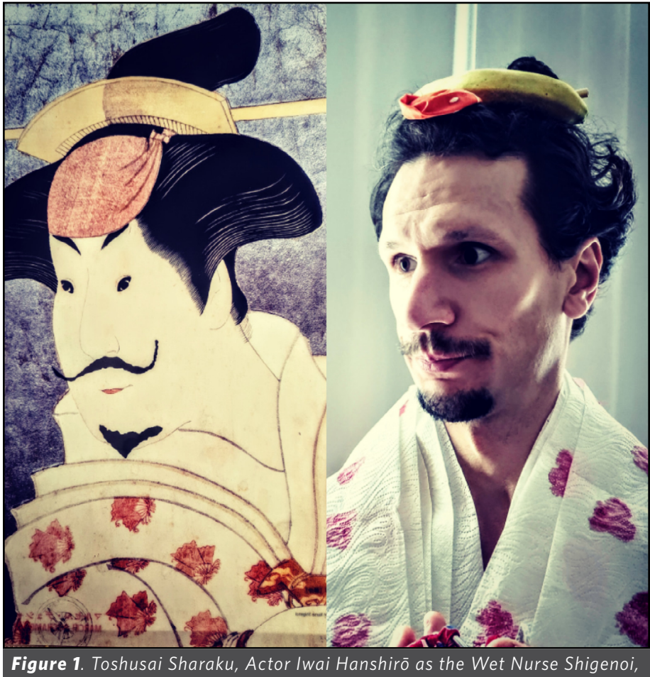
Figure 1 . Toshusai Sharaku, Actor Iwai Hanshirō as the Wet Nurse Shigenoi, 1794, "Marcel Duchamp and Japanese Art" exhibition version, and author's impersonation.

For my part, the pandemic has made me reconsider the relevance of self-ethnography. As a scholar of Japonisme, I am interested in the inflections of Japanese culture and media in other cultures. I have recently been inspired by the proliferation of art memes on social media, especially Instagram, which was accelerated by the pandemic. It is not only a visual but also a performative phenomenon: during 2020, the act of recreating classic artworks by dressing up with household objects went viral. For example, the hashtag #betweenartandquarantine has been used more than fifty thousand times. The popularity of artwork impersonation stems arguably from its invitation to participatory responses to works of art at a time when physical access to the artworks is temporarily restricted.