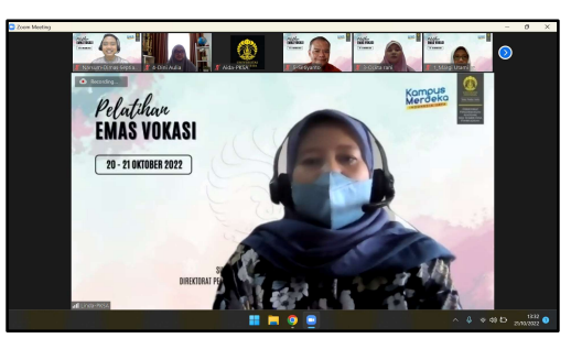
Figure 02. Conducting online training to lecturers about the usage of LMS EMAS

8. Before the pandemic, lecturers or students get EMAS troubleshooting by phone call or come visit the helpdesk room at the SDP office. On pandemic, this was no longer allowed. We shift to an online helpdesk available using Purechat.com live chat on the EMAS1 dan EMAS2 website. This is quite a good solution because if lecturers and students have problems right away, they can chat immediately with a helpdesk agent and resolve the problem. The number of agents also adds 2, becoming 4 people in total. Here are the performance reports.