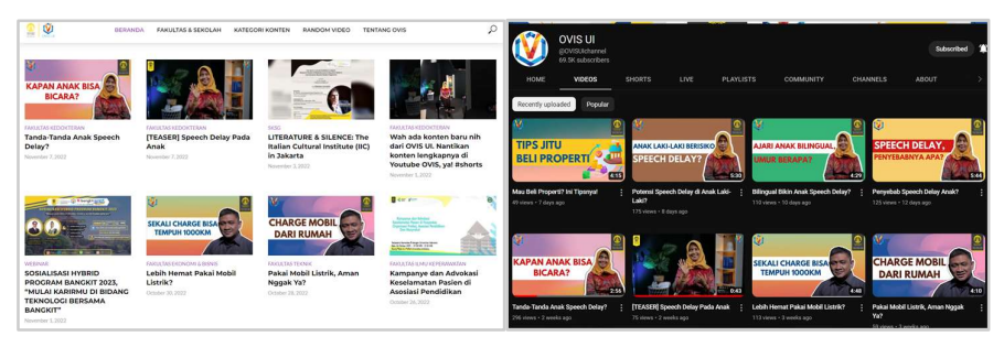
Figure 10. OVIS UI Website

SDP also manages the display network for all uploaded open-content video, located in the YouTube channel (<u>youtube.com/@OVISUIchannel</u>) and OVIS UI website (<u>ovis.ui.ac.id</u>). Number of published video is 710 (per 11 November 2022). Closedcaptioning these videos is work in progress.