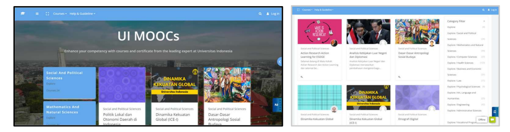
Figure 06. MOOCs UI Website (idols.ui.ac.id)

LMS for MOOCs (IDOLS) are made separately from blended-learning LMS (EMAS) to be easier managed because there is some notable characteristics differentiation between regular courses and MOOCs. In 2023, we plan to upgrade it, with newer Moodle, better server environment, and add some needed features.