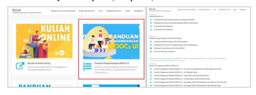
Figure 07. Development Guidance of MOOCs UI

Develop tutorials and guidance series on MOOCs development. This tutorial covers IDOLS LMS how-to-use, video production steps, and online delivery program designs. MOOCs Development Class also be made on IDOLS so lecturers can learn and experience LMS directly at each pace (self-paced).