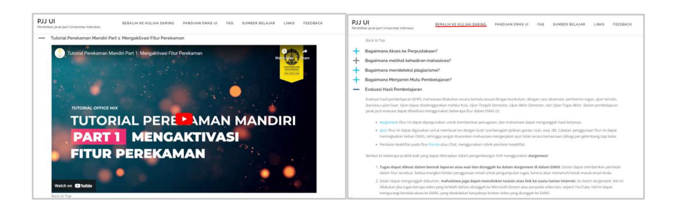
Figure 01. Sample of tutorial in pjj.ui.ac.id (left) and pjj.ui.ac.id's website (right)