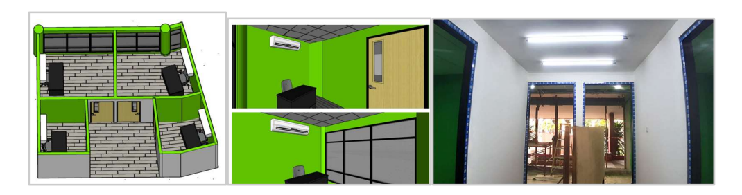
Figure 09. Design of MRR & Renovation Progress per November 2022

SDP also manages the display network for all uploaded open-content video, located in the YouTube channel (<u>youtube.com/@OVISUIchannel</u>) and OVIS UI website (<u>ovis.ui.ac.id</u>). Number of published video is 710 (per 11 November 2022). Closedcaptioning these videos is work in progress.