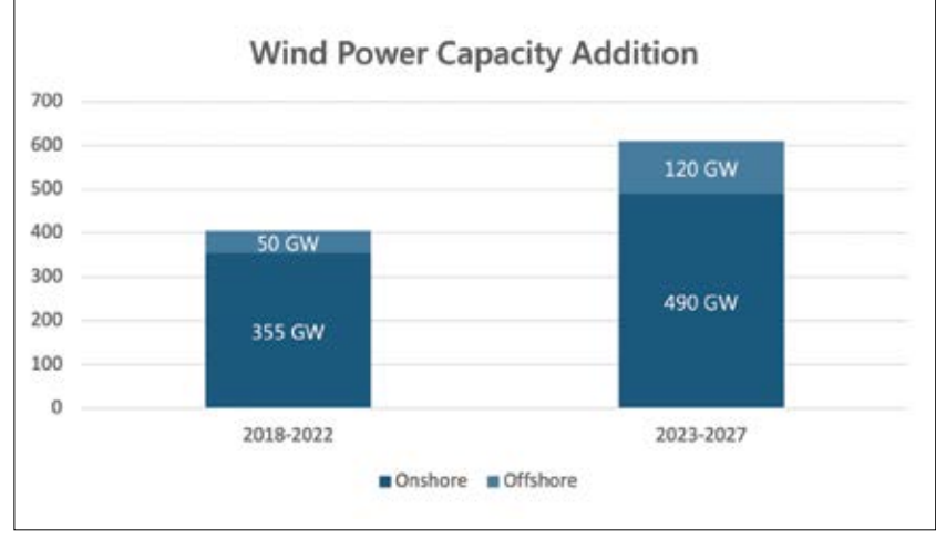
Figure 3. Total global wind power capacity additions.

Besides investment challenges for grid modernization driven by decarbonization, the grid faces other challenges to digitalization