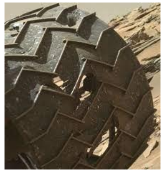
Curiosity's wheel damage