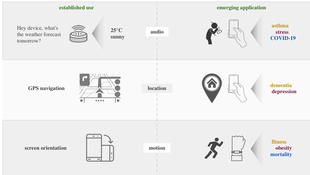
Figure 1. Established use of sensors and emerging applications of mobile health. An illustration of established and emerging applications that mobile sensing enables. For example, the same models that are used in speech recognition can be repurposed for voice-based biomarker discovery (e.g. through coughing). Likewise, GPS and motion sensors can be used for early diagnosis of dementia or even all-cause mortality.

inevitably a multitude of implications and limitations existing due to modelling, such as privacy concerns, human-introduced biases, practical deployment in clinical practice, and improved usability and user experience for human–computer interfaces.