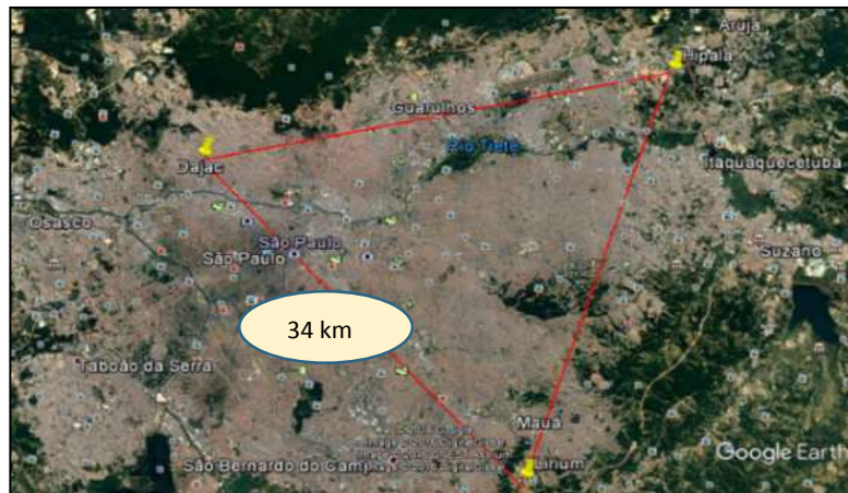
Figure 3: Distances em linha reta entre Dajac, Hipala and Lirium