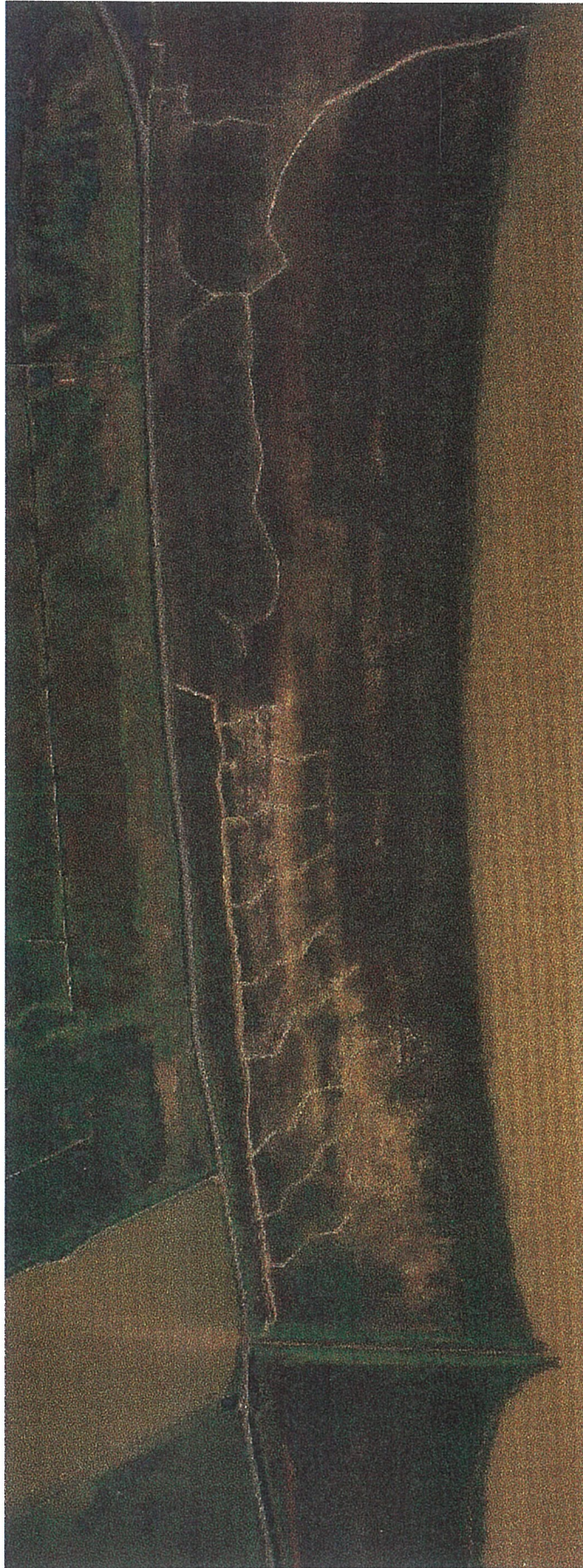
Note: The photo longitudinal axis is oriented east-west with the Bay to the right (south).