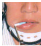
Fig. 1. Regulation and adjustment of clenching strength. A bite block equipped with an occlusal force sensor was prepared to measure clenching at the position where the right upper and lower canine cusps came into contact. Intensity of clenching was shown on a display and feedback was provided to the subjects.