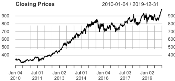
Figure 2: S&P 500 Pharmaceutical Returns from 2010 to 2019.

Due to the presence of heteroscedasticity and unit roots, logarithms will first be applied to the data to contain the heteroscedasticity and then it will be differentiated to remove the trend. The resulting dataset will represent the historical returns and is expected to exhibit white noise behavior. The resultant dataset will henceforth be referred to as “pharmareturns” and will be used for the rest of the modeling.