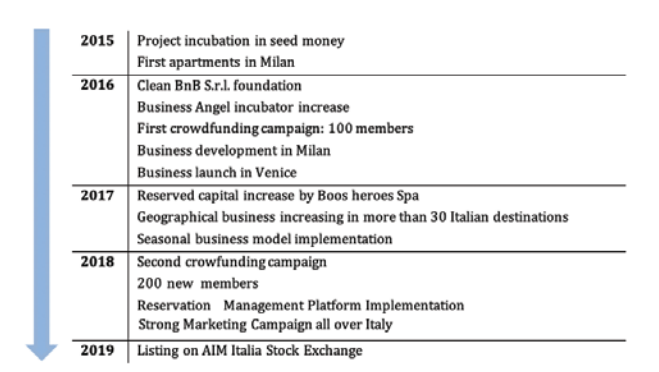
Figure 2: CleanBnb start-up history

success of this ambitious project as national best practices, thus showing the strong potential of crowdfunding implemented in two steps on the Italian platform¹ Crowd-FundMe . A first campaign launched from February to June 2016 for €50,000 obtained the striking result of 253% of success for an overall amount of €126,702. This first campaign contributed to the launch of the project, and gained market visibility and business partners. A second campaign followed from March to April 2018 for a total amount of €500,000, although it had a different focus compared with the first one: to empower the core business of CleanBnb by expanding in new markets and by signing new partnerships.