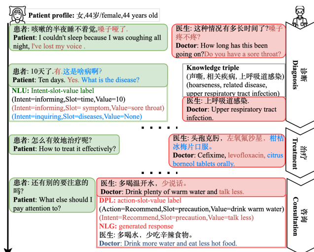
Figure 1: A practical medical dialogue involving consultation, diagnosis, and treatment. They are all dependent. Combined with the knowledge triple in the upper right corner, we can better infer the related diseases. The lower right part is our annotation example, including intention, slot and value.

guage understanding (NLU), dialogue policy learning (DPL), and natural language generation (NLG). However, they only focus on one of the sub-tasks. For example, Shi et al. (2020) study NLU, i.e., slot filling in medical consultation. Wei et al. (2018) investigate DPL in medical diagnosis. There is a lack of comprehensive analysis on the performance of all the above tasks when achieved and/or evaluated simultaneously.