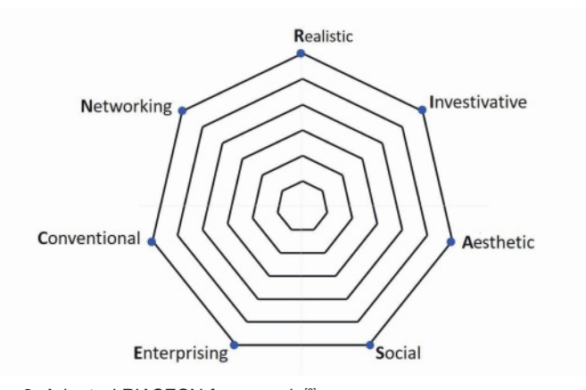
Fig. 2. Adapted RIASECN framework.[6]

and conceptual understanding is helpful. Table 1 shows how the role of the oceans in the climate system can be used to develop and apply basic conceptual understanding about chemical equilibrium. A fruitful connection supports the learning of chemistry via relevant contexts, but also learning through chemistry about contexts of relevance for e.g. societal debates.