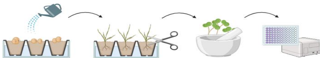
Figure 1: Preparation and processing of plant samples

In each tray, 20 seeds were planted on coconut fibre and then grown for 7 days. After harvesting the plants fresh weight of the tray-grown plants was measured.