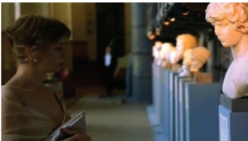
Figure 6. Antonia in Ferzan Özpetek's La fate ignoranti (2001).