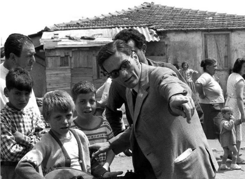
Figure 4. Pier Paolo Pasolini during the shooting of Accattone (1961).