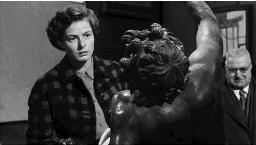
Figure 7. Katherine in Roberto Rossellini's Viaggio in Italia (1953).