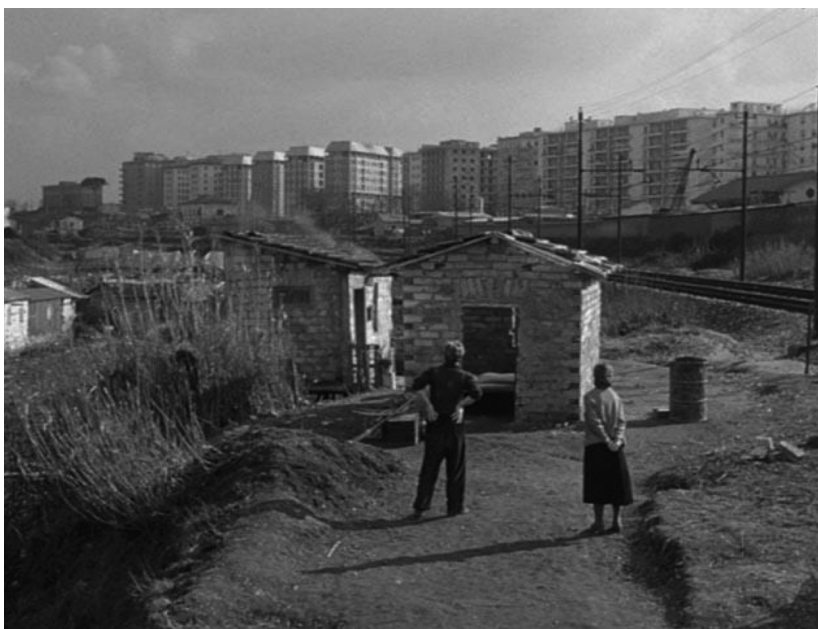
Figure 1. Scene from Vittorio De Sica's Il tetto (1956).