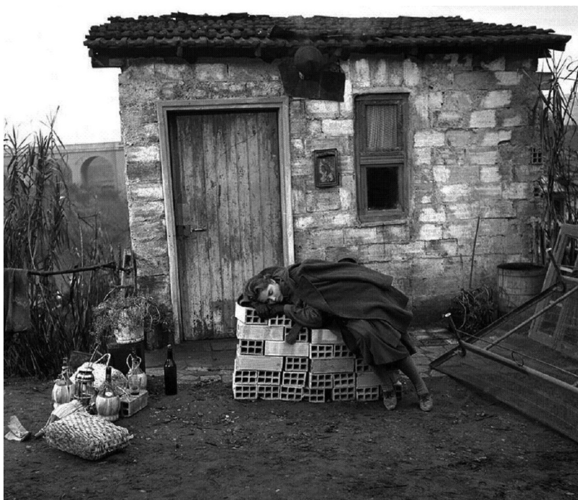
Figure 2. Scene from Vittorio De Sica's Il tetto (1956).