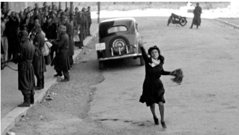
Figure 3. Scene from Roberto Rossellini’s Roma città aperta (1945) showing Anna Magnani as Pina.