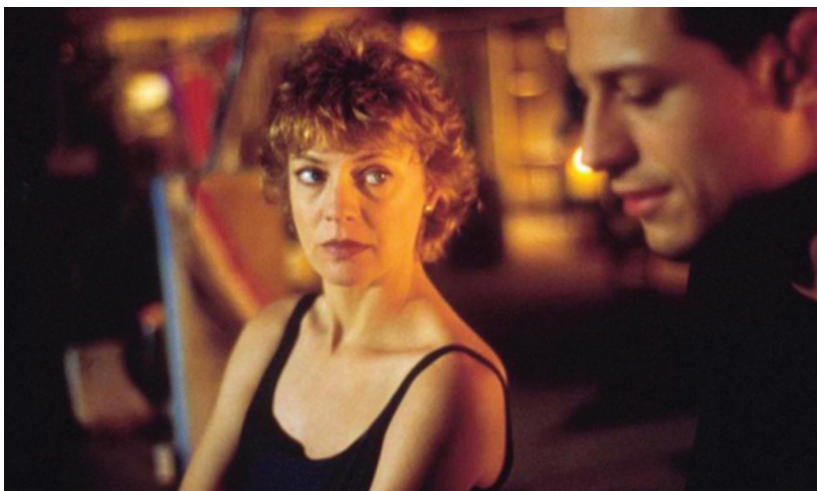
Figure 5. Antonia in Ferzan Özpetek's La fate ignoranti (2001).

feminine figure could also be understood as an allegory of this ambivalence. The ending scene with the couple sharing an intimate conversation that brings to mind the atmosphere of the interior space of a home in front of the skyline of Rome could also be understood as a device that aims to challenge the contrast between the intimacy of interior spaces and the chaotic character of the urban landscape. Through this device, the director manages to convey a new understanding of the emotions related to urbanity.