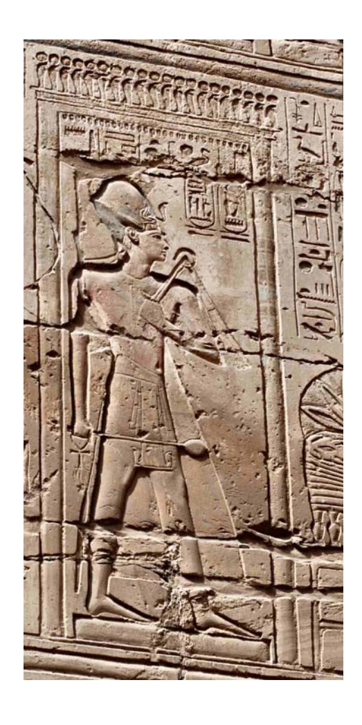
Figure 2: Seti I shown in the form of a statue standing on a plinth in a scene inscribed for Ramesses II. South wall, east half, hypostyle hall, Temple of Amun, Karnak.

on a scale comparative to many of the depictions for Ramesside kings in the hypostyle hall of the main Amun temple. Particularly informative is that Ramesses IX is depicted in the form of a statue, a form perhaps more suited to the depiction of a deceased king as in a nearby scene in the south-east corner of the main hypostyle hall representing Ramesses II making offerings to the deceased Seti I who, as shown in fig. 2, is also depicted as a statue. It is also pertinent that while Ramesses IX is clearly the senior figure, hierarchy of scale presents Amenhotep as being close in status, and he is clearly the more active agent in the scene. Such circumstances suggest that while perhaps not deceased, Ramesses IX is to be seen as inactive or ineffective in relation to Amenhotep and likely absent and, to some degree, inaccessible.