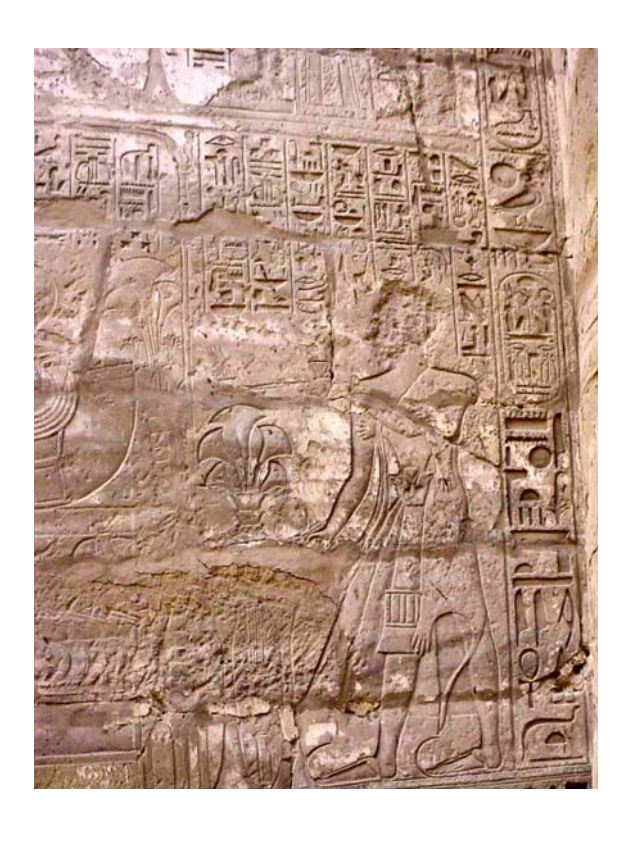
Figure 3: Herihor as hm-ntr tpy n Imn offering incense and pouring a libation before the barque of Amun-Re. North wall, west half of the hypostyle hall, Temple of Khonsu, Karnak.

With Herihor there was a change in the style of presentation. Herihor was sufficiently confident to commence a much more complex programme of decoration, firstly in the hypostyle hall of Khonsu Temple recognizing Ramesses XI as king, but subsequently in the forecourt in proclamation of his own kingship. <sup>48</sup> Depictions in the hypostyle hall show both