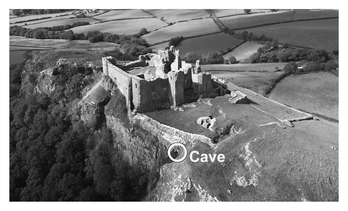
Fig. 1. Aerial view of Carreg Cennen Castle from the south-east showing the cave entrance.