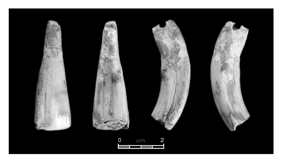
Fig. 4. The perforated horse tooth from Carreg Cennen Castle Cave.

AD 265–535 at 95% probability and cal. AD 354–440 at 77% probability (OxA-39194, 1649±21 BP), suggests that it belongs to the later Roman or early medieval period.