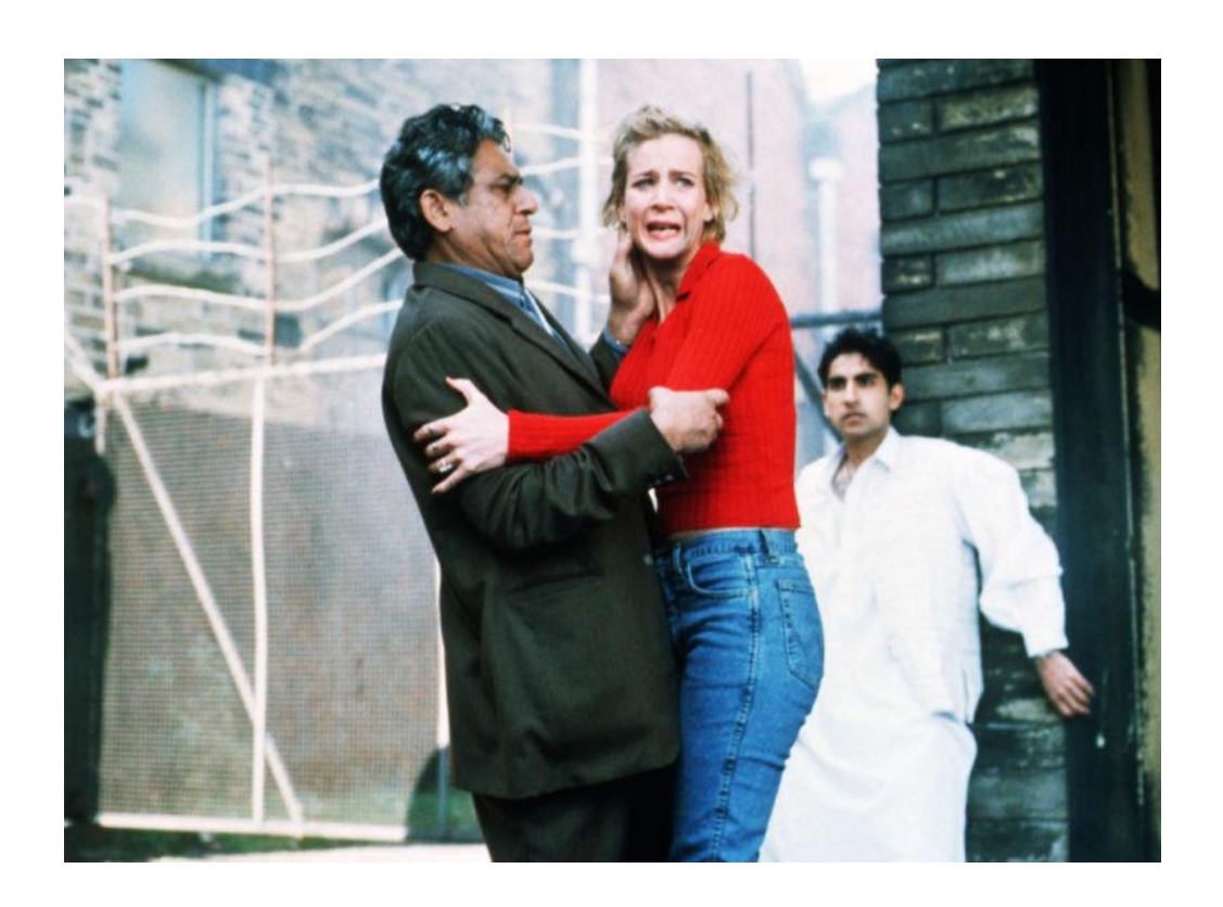
Fig. 2-1: A scene of mass protest against the prostitutes by religious extremists Maulvi and his group in the film still My Son the Fanatic (1997).

As Kureishi's works emphasize, these ignorant youths are unable to realize how they are being utilized at the hands of the opportunistic leaders such as Maulvi in the film, My Son the Fanatic or Riaz in The Black Album .