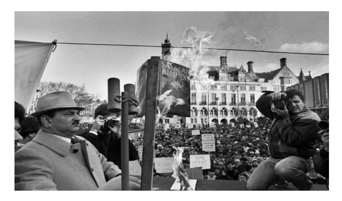
Fig. 2-2: A Demonstration against The Satanic Verses in Bradford, England in 1989.

Shahid in The Black Album becomes a mouthpiece of Kureishi. Shahid is unable to accept the fact that a book which is a medium of story-telling can adhere to the elements of censorship; how can an author follow certain norms of dos and don'ts to write a book? It's surprising to Shahid that how could a writer's imagination be set to its limit. It's obvious that any creative work would lose its grandeur if controlled. Shahid believes that "A free imagination ranges from many natures, its purpose is to look into itself and illuminates others (BA, 183). He asks Riaz, "And story-telling. ... What mustn't be said. What is taboo and forbidden and why. What is censored. How censorship benefits us in exile here" (BA, 182). Shahid realizes that the world outside is "more subtle and inexplicable" (BA, 133). Shahid realises that the conflict lies in the very ideological foundation of Riaz's group which considers imagination "would poison all, rendering their conviction human, aesthetic, fallible" (BA, 133). The later violence of the group towards the book which they burn openly is the outcome of their adherence to their rigid religious principles that reject creativity or imagination. This conflict forms the ground for the central battle between liberalism and religious fundamentalism in The Black Album.