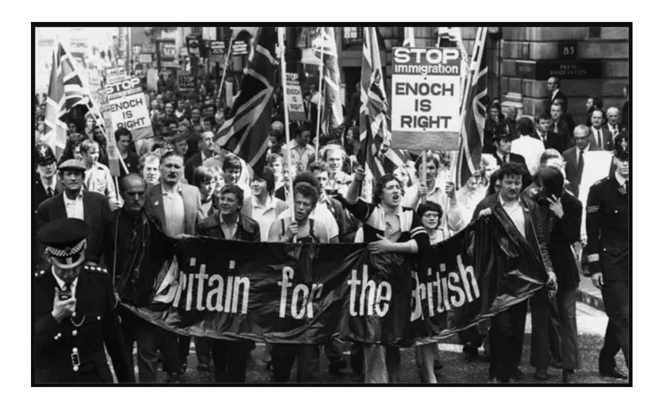
Fig. 3-2: Anti-immigration protestors march to the Home Office in August 1972.

Powell like any other racist and right-wing politician used to spew venom at the outsiders, and minorities, and threatened the survival of the black Asian community in Britain. Powell suggested establishing a Ministry of Repatriation that would send the children of immigrants back to their home country as formulated by Kureishi, "A policy of assisting repatriation by payment of fares and grants is part of the official policy of the Conservative party" (Kureishi, Knock, Knock. 2014). Kureishi in the same essay, "The Rainbow Sign", also defines Powell's attitude to the Asian immigrants whom he thinks are unsuitable in this country. In 1965, Powell said, "We should not lose sight of the desirability of achieving a steady flow of voluntary repatriation for the elements which are proving unsuccessful unassimilable" (RS, 6). Powell would rather become the Viceroy of India than live in post-imperial multicultural Britain. His xenophobia and frustration with the Pakistani community are quite direct and biased when he says, "... because of the Pakistanis 'this country will not be worth living in for our children" (RS,