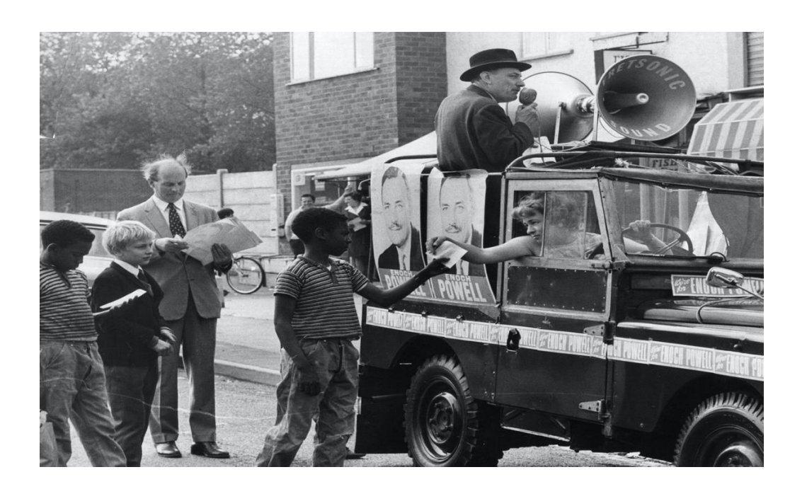
Fig. 3-3: 9th June 1970, British Conservative politician Enoch Powell electioneering in his Wolverhampton constituency as his wife hands out election literature from their land rover.

the wogs out, get the coons out" and "Keep Britain White" (Kureishi, Knock, Knock). The terror seems to be state-sponsored and institutionalised when regulated by educated people or politicians such as Powell and by the teachers or fellow students in schools and colleges. The immigrants or the non-white community faced discrimination and challenges very badly during this period. The misery of the situation is evident in the immigrants like Kureishi who perceived themselves as belonging nowhere. Kureishi, being English by birth, would face the same situation if deported to India because he is the 'offspring', the child of the immigrant, and as such belongs to nowhere. He imagined himself a parentless unwanted mongrel hunting for food in the woods nearby (Kureishi, Knock, Knock, 2014).