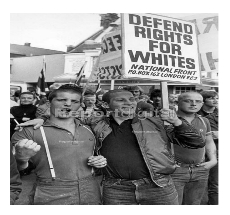
Fig. 4-1: Reportage photo of Skinheads, National Front Rally, Fulham, London 1981, 30 August- Report Digital.

The image below shows the skinhead cadres of the right-wing organization, National Front protesting to defend the rights for the whites.