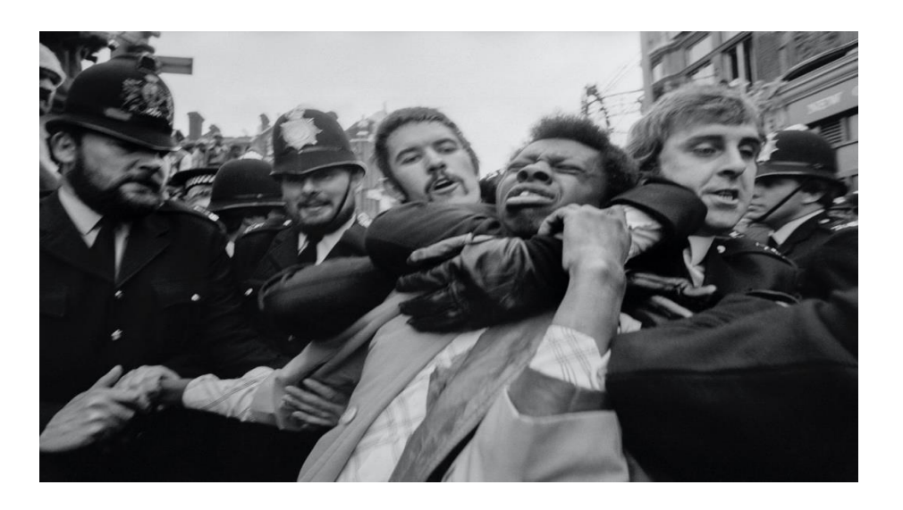
Fig. 4-3: Peter Marlow Race Riots in Lewisham. Police making an arrest. England. London. GB. 1977.

with the recent killing of an unarmed black African-American, George Floyd, by a white police officer in Minneapolis, USA (BBC News, 2020). This incident of killing a black man triggered a worldwide protest in the name of BLM (Black Lives Matter). The incident was followed by riots, looting, and destruction in major cities in America. The atrocities or the inhuman treatment of the black people at the hands of the racist white police officers is not a new phenomenon but has always been carried out a decade after decade. The insignificance and the triviality of the black lives can be easily realized from the brutal killing of George Floyd in recent days and also the killing of the black mother in Kureishi's play Sammy and Rosie Get Laid. Both of them are the victims of structural racism and are targeted because of their race which was defined by colors. The Critical Race Theorists such as professor Mari Matsuda, a law professor at the University of Hawaii says, "The problem is not bad people... The problem is a system that reproduces bad outcomes. It is both humane and inclusive to say, 'We have done things that have hurt all of us, and we need to find a way out." (Fortin, 2021). The killings of these individuals define how racism has been, social and historical context, practiced in the British society. The image shows the police brutality against the black people and how they exercise disproportionate power against the blacks in Britain in the 70s and 80s.