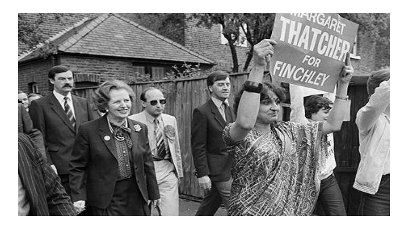
Fig. 4-2: Lady Thatcher privately complained that too many Asian immigrants were being allowed into Britain.

The image of Thatcher's election campaign showing her increasing popularity in the British society.