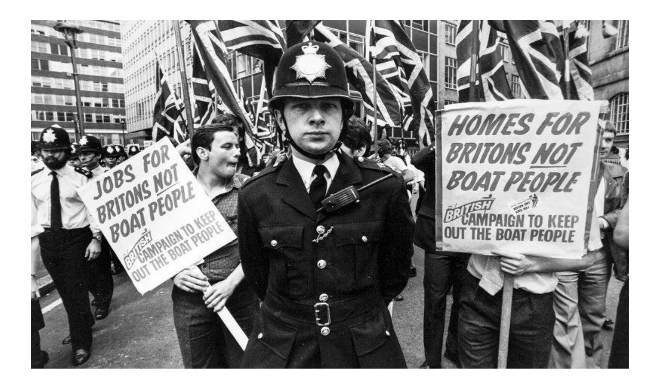
Fig. 3-1: A protest against the black minorities. Back to the future: what the turmoil of the 1970s can teach us today- New Statesman.

London. The cadres of the National Front were highly active and violent against the non-whites. They attacked the lower class and unprotected immigrants who left their home country for their dreamland, Britain. Powell and his followers held the immigrants responsible for infiltrating their culture and land. They also held the immigrants responsible for the unemployment, lack of housing and poverty in Britain. The image below demonstrates the resentment of the whites against the immigrants who they believed have deprived them of their benefits such as jobs and housing.