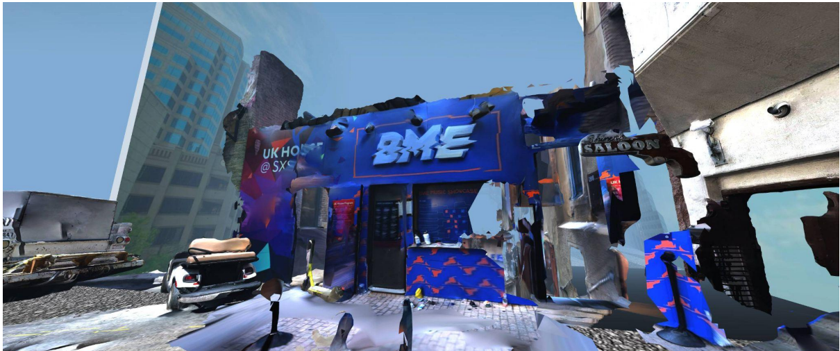
New Rendezvous Street: An archaeology of the future

Earlier this month, between 11-14 March, the RCA took part in the SXSW Festival in Austin, Texas, for the first time, at UK House, the Department for Business and Trade's showcase for UK Creative Industries.