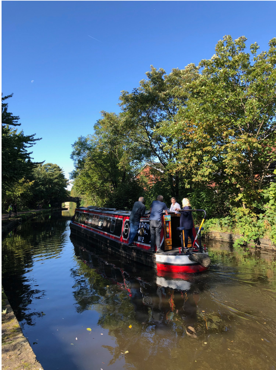
FIGURE 1 Slow pace of a moving place: a narrowboat navigates the Ashton Canal in Manchester.

(Fullagar et al., 2012, p. 3). This is characterised by certain pensiveness and attentiveness to the environment, brought about by the abundance of time as the vessel allows its inhabitants to connect more deeply to the whole of canal network: