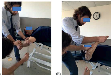
Figure 3. (A) Glenohumeral External Rotation (ER) Range of Motion. (B) Glenohumeral Internal Rotation (IR) Range of Motion.

Data collection for glenohumeral IR and ER ROM was based on the methods published by Wilk et al. (2011) (Fig. 3). Measurements of AROM and PROM for both ER and IR of the throwing and non-throwing arms were taken before any warm-ups, exercises, or throwing activities. The examiner assessed AROM first, followed by PROM for each athlete. The certified athletic trainer assigned to the team assessed shoulder ROM for all participants. The participant's UE was placed in 90 degrees of shoulder abduction in the scapular plane with the scapula manually stabilized by a second examiner. The scapula was manually stabilized at the coracoid process rather than at the humeral head to avoid altering the normal glenohumeral arthrokinematics. The athletic trainer decided when the athlete's end IR PROM was reached when the coracoid process rose into the athletic trainer's thumb and they observed compensatory movements. The previously described protocol yielded ICC of 0.87 and 0.81 for GH ER and IR ROM (Wilk et al., 2011). Mihata et al. (2016) utilized the same supine passive glenohumeral IR and ER test positions resulting in an inter-rater ICC of 0.78 and an intra-rater ICC of 0.89.