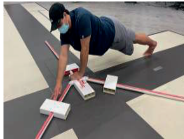
Figure 2. Lower Quarter Y-Balance: Superolateral Reach shown. Not shown is Inferolateral and Medial reaches.

The protocol for the UQ-YBT and LQ-YBT (Fig. 1 and Fig. 2) followed the one proposed by Westrick et al (2012) and Plisky et al (2009), respectively (Plisky et al., 2009; Westrick et al., 2012). Each pitcher performed three consecutive practice trials on the right and left UE for all three reach directions, then completed three test trials on the right and left UE for all three directions on the UQ-YBT followed by the LQ-YBT. The UQ-YBT (Boudreau et al., 2022) assesses upper quadrant closed chain movement limitations and asymmetries to identify motor control deficits. The UQ-YBT has good test-retest reliability (ICC=0.80-0.99) and interrater reliability (ICC=1.00) (Gorman et al., 2012). However, the utility of UQ-YBT for overhead athletes has yet to be elucidated (Bauer et al., 2020; Borms et al., 2016).