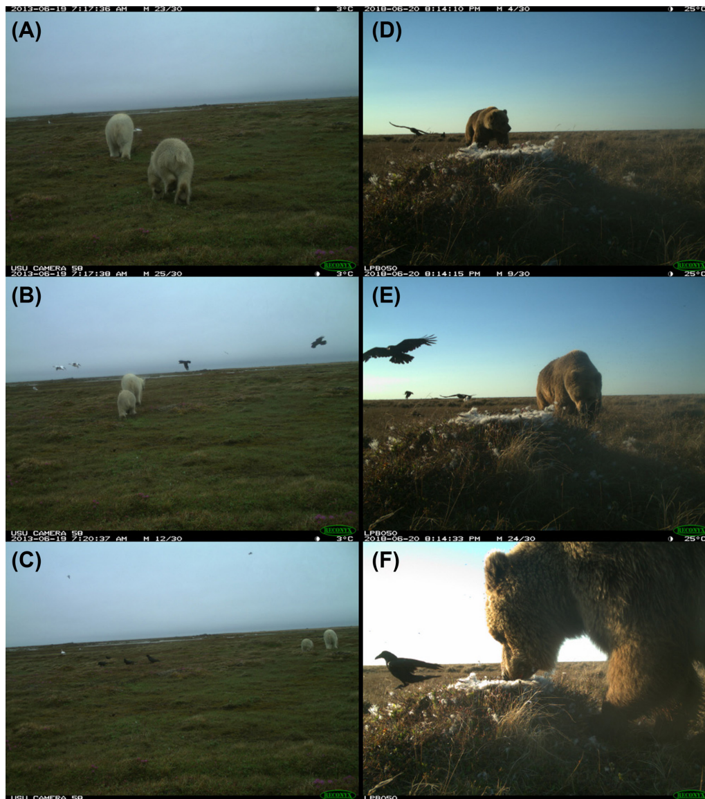
Figure 3. Observations of avian predators following bears foraging in a nesting lesser snow goose Anser caerulescens caerulescens colony. (A–C) A female polar bear Ursus maritimus and cub cause a female snow goose to abandon her nest. Following predation of the nest, four common ravens Corvus corax inspect the nest. (D–F) A lone grizzly bear Ursus arctos approaches and consumes a snow goose nest and is closely followed by at least three common ravens.

Barnas et al. 2020). We observed close associations between avian predators and bears in nesting snow goose colonies, and suggest that this association is likely an attempt by avian predators to capitalize on colony disturbance as a result of bear presence. We failed to detect differences in snow goose