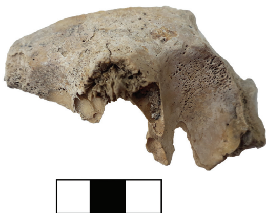
Slika 3 – Cribra orbitalia , dečija individua Figure 3 – Cribra orbitalia , child individual

Since it was not possible to determine which bone belongs to which individual, the frequency of