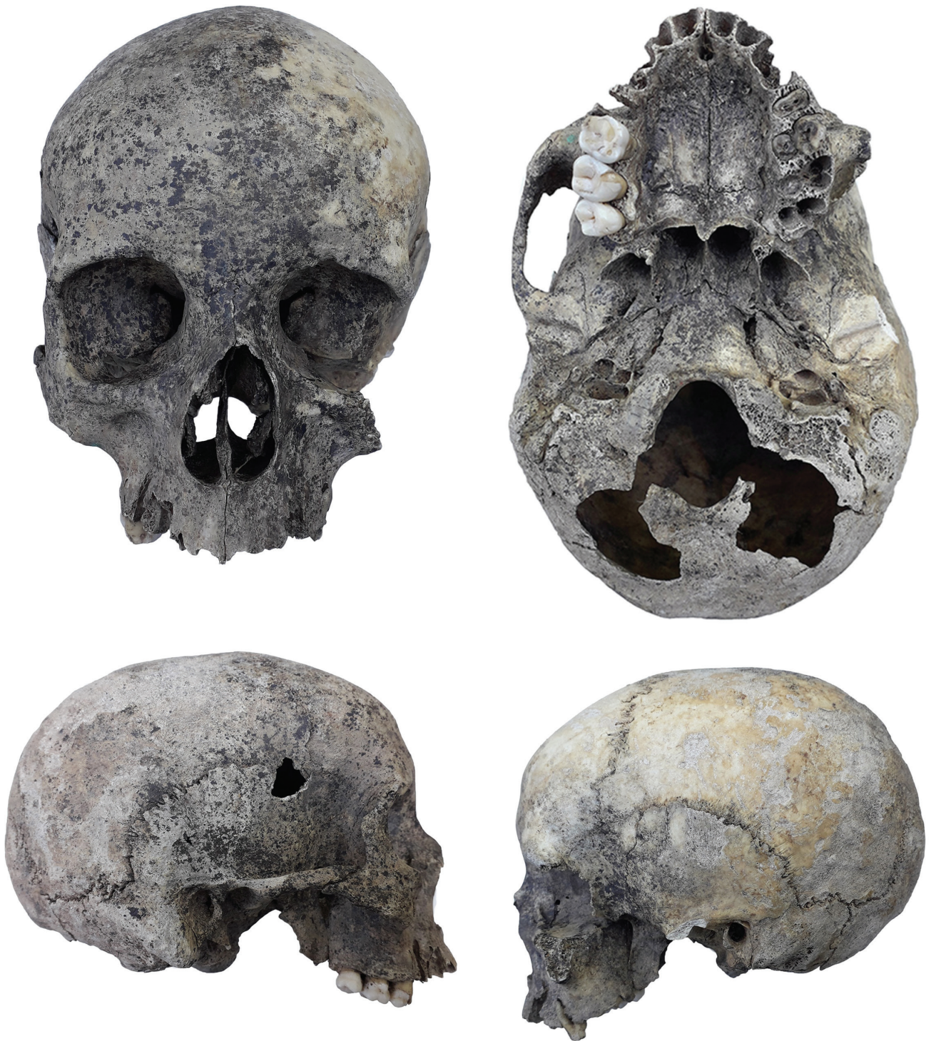
Tabla 1 – Lobanjske projekcije, ženski pol, starost 20–35 godina Plate 1 – Skull projections, female, aged 20–35