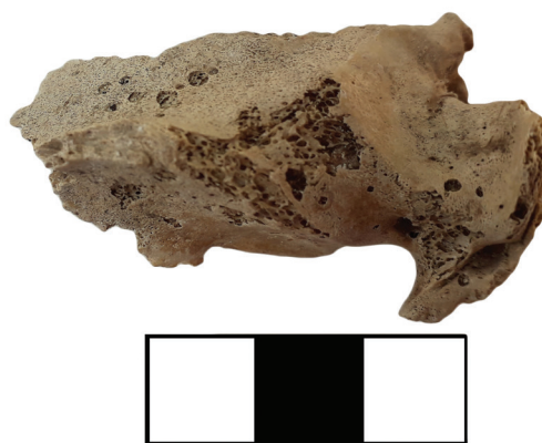
Slika 4 – Porotične lezije na sfenoidalnoj kosti, dečija individua Figure 4 – Porotic lesions on sphenoid bone, child individual