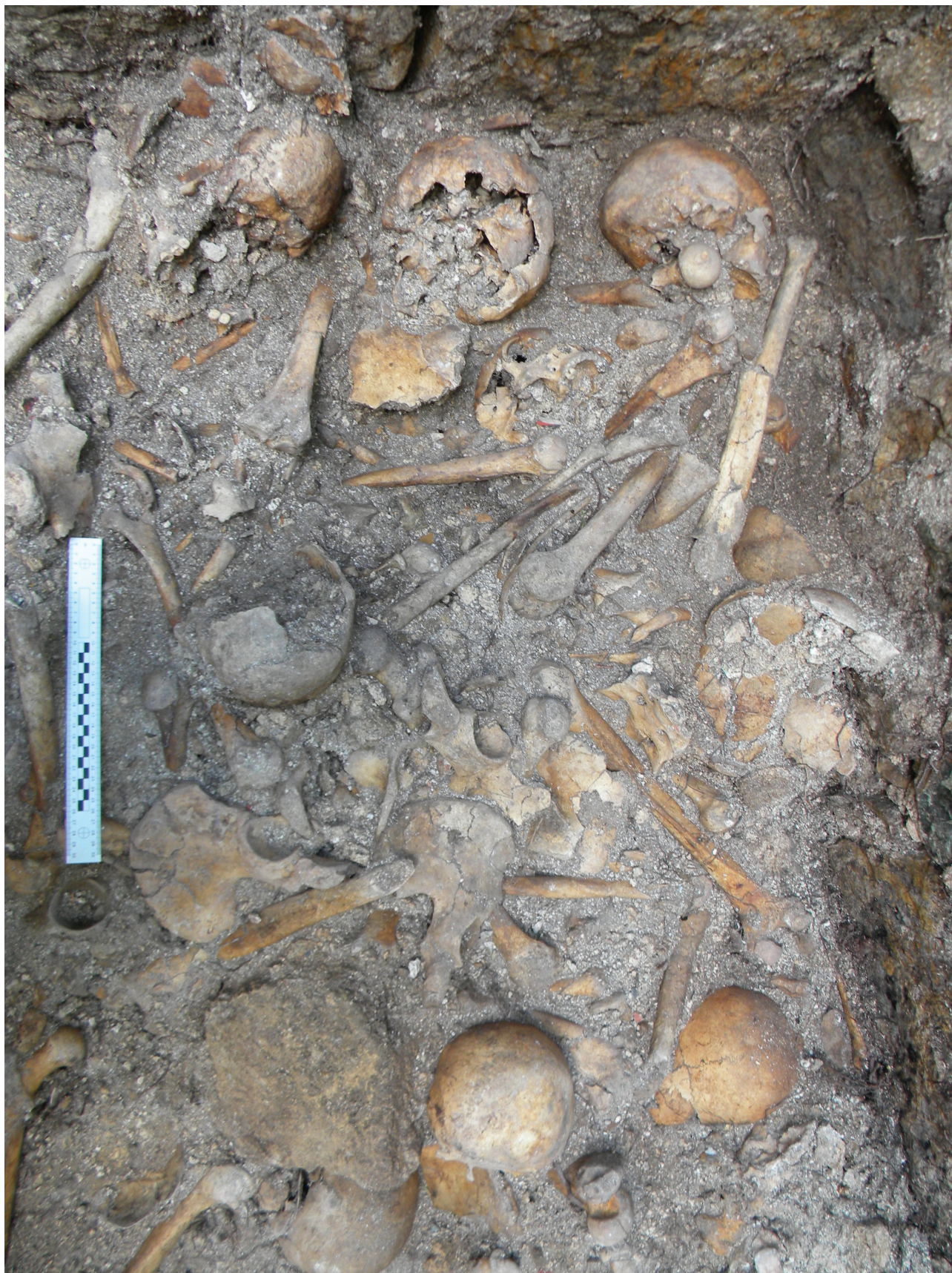
Sl. 2 – Nagomilane ljudske kosti u prostoriji, detalj. Fig. 2 – Commingled human bones in the room, detail.