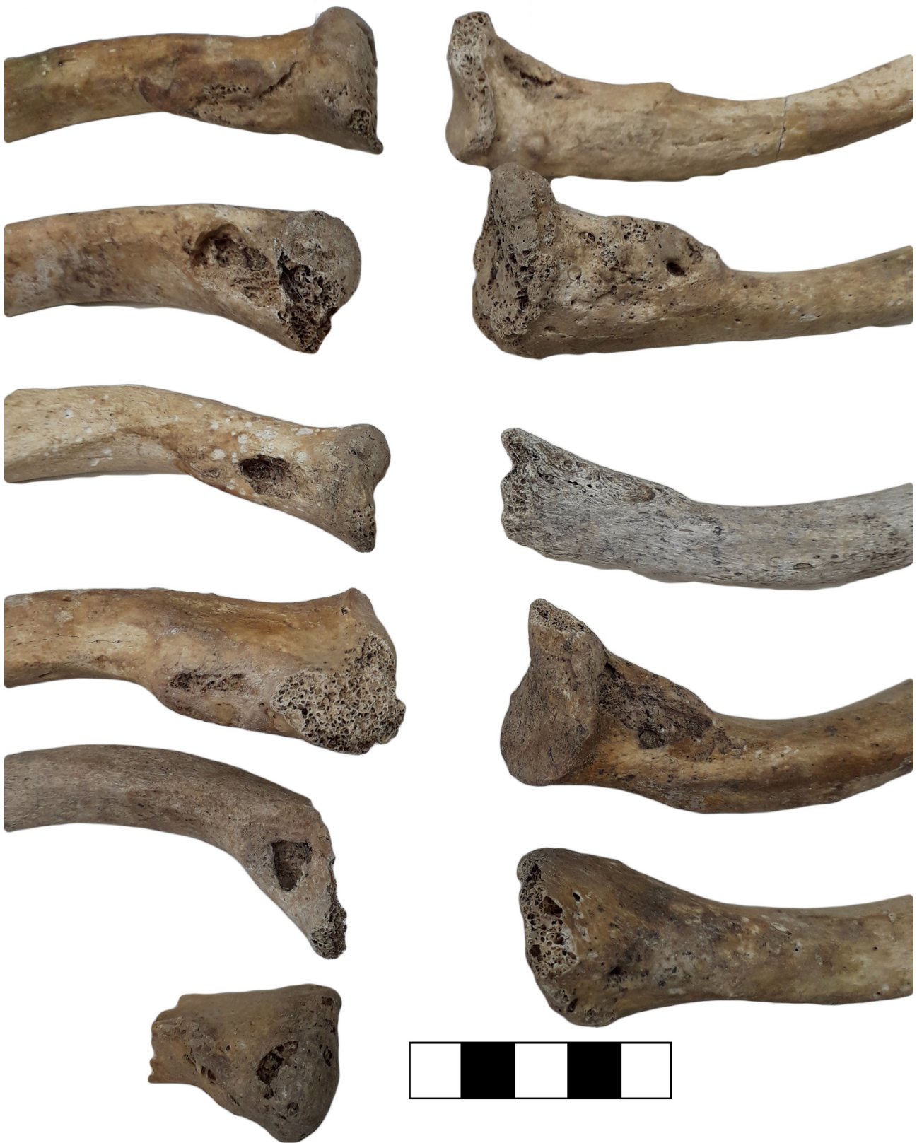
Sl. 7 – Izražena hvatišta ligamenata na desnim klavikulama ( lig. costoclaviculare ). Fig. 7 – Pronounced ligament attachment points on rights clavicles ( lig. costoclaviculare ).