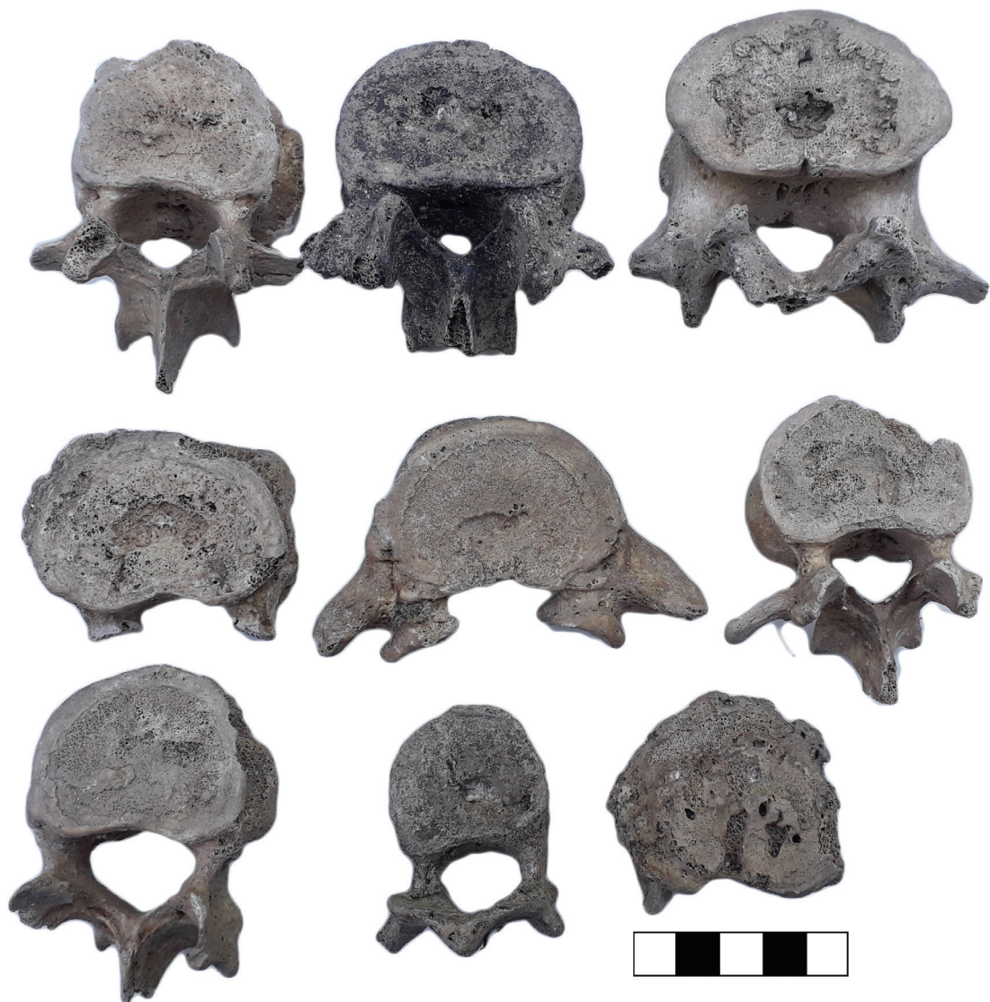
Sl. 5 – Šmorlov defekt na slabinskim pršljenovima.