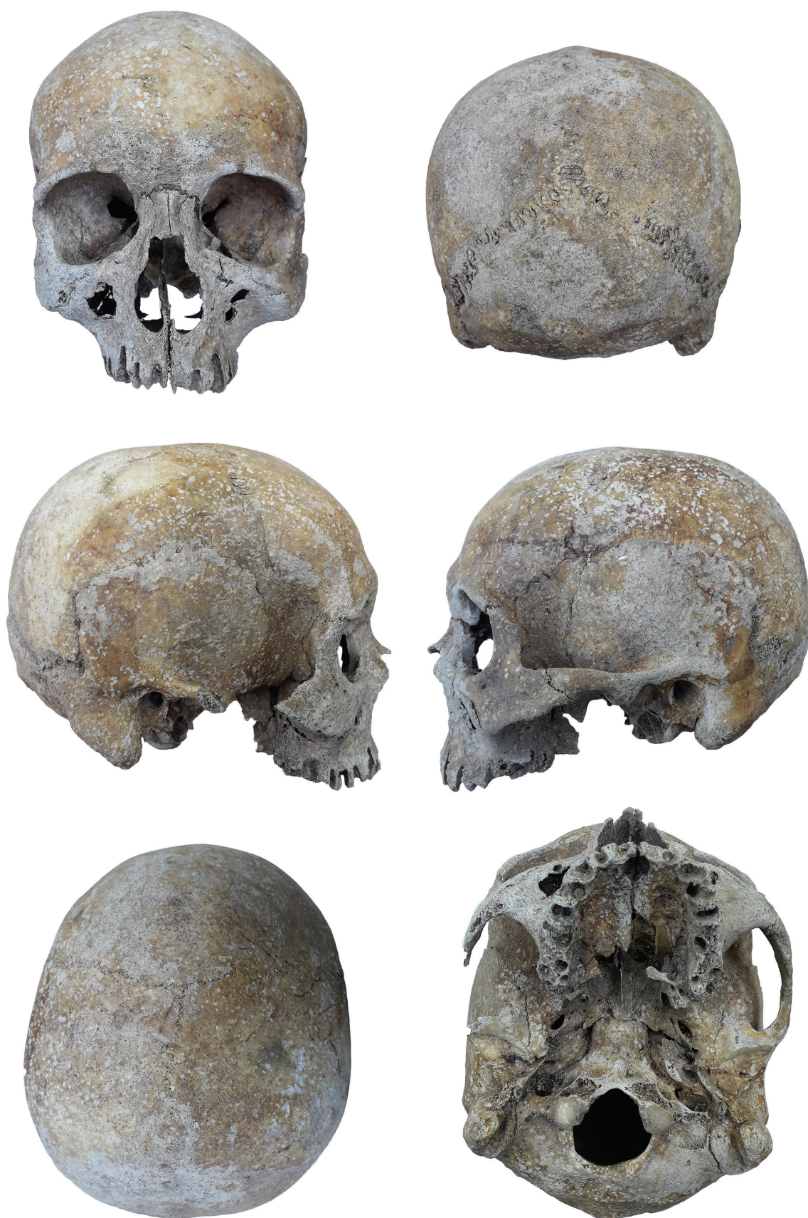
Tabla 2 – Lobanjska projekcija, muški pol, starost 50 + godina Plate 2 – Skull projections, male, aged 50+