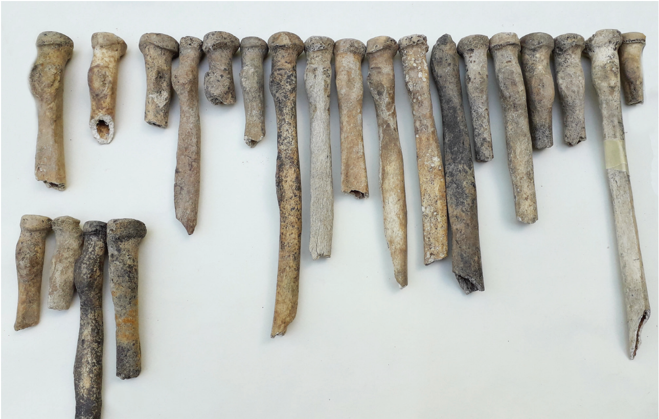
Sl. 6 – Izražena hvatišta mišića na levim radiusima ( m. biceps brachii ).