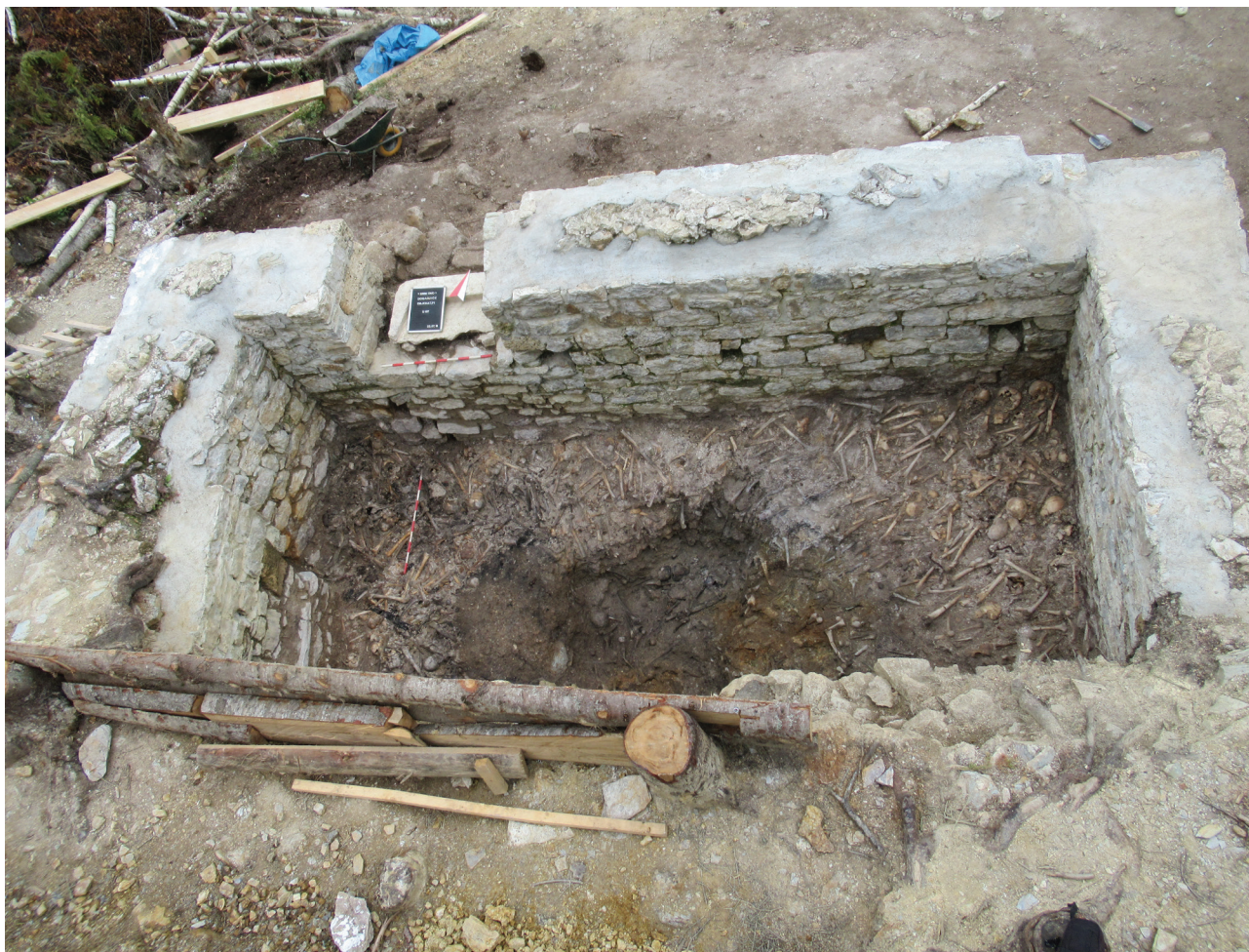
Sl. 1 – Nagomilane ljudske kosti u prostoriji. Fig. 1 – Commingled human bones in the room.

skeleta su bile nabacane, skeleti nisu bili u anatomskom položaju, što znači da su meka tkiva već bila razgrađena, za šta je potreban duži niz godina). S obzirom na to da je reč o sekundarnoj sahrani, nije moguće koristiti preciznije opisne šeme o stepenu očuvanosti skeletnog materijala, i može se samo konstatovati da li je skeletni materijal, odnosno pokosnica kosti, dobro ili loše očuvana. Iako stepen očuvanosti kostiju zavisi od prirodnih faktora, odnosno uslova u zemlji (kiselost zemlje, podzemne vode i sl.), same prirode kosti (kosti dečijih individua i starih individua su podložnije destrukciji), zavisi i od pogrebne prakse (da li se pokojnici pokopavaju brižljivo ili ne, kakav je intenzitet sahranjivanja, da li postoje grobne konstrukcije ili ne i sl.) (Миладиновић-Радмиловић 2008a: 446–447). Takođe, na stepen očuvanosti utiče i samo arheološko iskopavanje, kao i tretman nakon