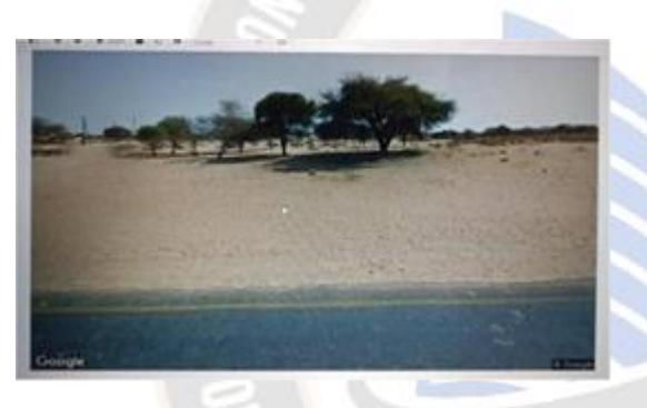
Figure 2. Non Garbage Area

The phrase "non-garbage area" denotes a location free of trash. We can see above non-garbage area without any accuracy in the image below, without any accuracy that was plainly stated, detected. No accuracy was attained since no waste was found.