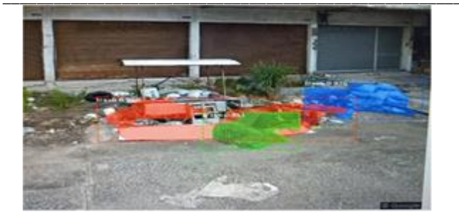
Figure 1. Garbage Area in Different Colours

Since the area is loaded with garbage, the red, blue, and green colours here indicate that the area is full with garbage.