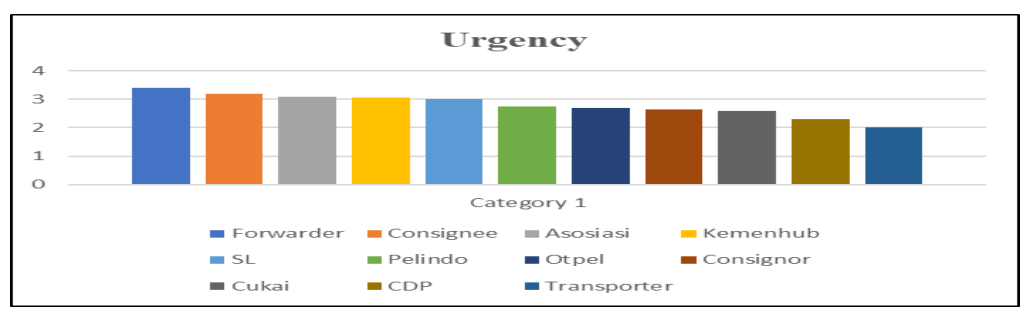
Figure 5. Actor's urgency level. Source: the result of the analysis

The third element determines the position of actors in the interest they have in the implementation of Multimodal Transport. The relevance of actors indicates how many different types of actors are required to execute multimodal transportation. Importance and influence can coexist, although this is not always the case. Actors are vital, yet they have minimal impact on the outcome.