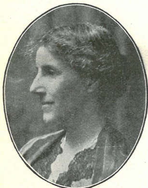
CHARLOTTE PERKINS GILMAN December 30