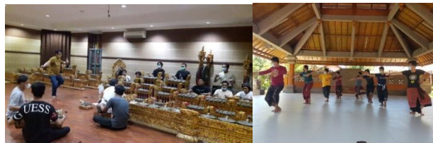
Gambar 3. Casting Musical Instrumentation/Accompaniment Dance and the Movement of the Baris Sesadar Dance

dancer's practice movements, and vice versa, the dance moves are used as reference standards to create and sharpen the dynamics of musical accents.