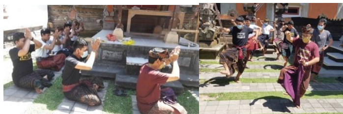
Figure 2. Nuwasen.

At this stage of the experiment (improvisation), possibilities for movement with the nuances of marching and Barong Landung will be sought. The movement structure of the dance will adjust to the accompaniment of the accompanying music, namely the Bebonangan and Batel gamelan. Beginning with the trial phase, looking for an auspicious day to begin the practice which in Hindu belief is commonly known as newasen. At the time of Newasen, a prayer was held with the dancers on June 24 2021 (full moon day, sasih kasa) at Ardha Nara Swari Temple, ISI Denpasar. After doing the prayer, improvisation of movements and some vocal exercises related to the idea was carried out. The movements that have been produced are documented via video and sent to each dancer so that during practice the following day, the movements that have been obtained will not be forgotten. The exercises are carried out in groups in a dance studio while adhering to health protocol rules and independent exercises are carried out via audio and video recordings. This process is carried out every time you rehearse by the stylists themselves or practice with the dancers.