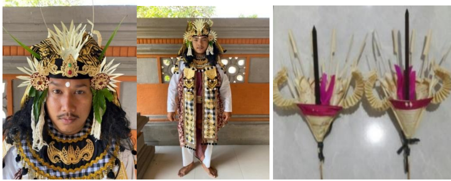
Figure 5. Makeup, Costumes and Props for the Baris Sesandaran Dance

Apart from covering the dancer's body, the attire also functions to show the character/identity of the work and add to the attractiveness of the appearance. The color selection is more dominant using black and white to add a religious impression. The black and white color (poleng) and classic motifs are the identity of the Barong Landung clothing. The attire used consists of: white shirt and trousers, classic patterned cloth/kamen, saput with Poleng color combination of classic motifs to cover the body, Poleng color Badong to cover the neck, Poleng color angkeb to cover the back, semutut to tie the keris, keris, wigs, udeng/headaddresses for headaddresses. The property used is a large stick of incense decorated with coconut leaves which is carried by each dancer to bring the audience into a religious mood.