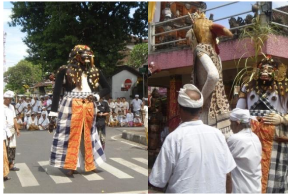
Figure 1. Barong Landung at Banjar Kaliungu Kelod Denpasar

At this stage of the experiment (improvisation), possibilities for movement with the nuances of marching and Barong Landung will be sought. The movement structure of the dance will adjust to the accompaniment of the accompanying music, namely the Bebonangan and Batel gamelan. Beginning with the trial phase, looking for an auspicious day to begin the practice which in Hindu belief is commonly known as newasen. At the time of Newasen, a prayer was held with the dancers on June 24 2021 (full moon day, sasih kasa) at Ardha Nara Swari Temple, ISI Denpasar. After doing the prayer, improvisation of movements and some vocal exercises related to the idea was carried out. The movements that have been produced are documented via video and sent to each dancer so that during practice the following day, the movements that have been obtained will not be forgotten. The exercises are carried out in groups in a dance studio while adhering to health protocol rules and independent exercises are carried out via audio and video recordings. This process is carried out every time you rehearse by the stylists themselves or practice with the dancers.