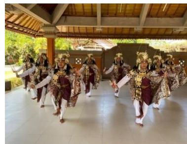
Figure 4. The form of the Barrier Dance

At this stage, costumes are made according to the design/idea. After the costumes were finished, a photo documentation of the costumes worn by all the dancers was made. This documentation was carried out on August 1, 2021. To avoid discomfort in moving, it was felt necessary to carry out a staging trial using costumes. This trial was carried out on August 4, 2021 in front of the ISI Denpasar Temple. After the trial, there were several parts of the costume that needed to be repaired because they seemed to interfere with the movements performed by the dancers. After feeling