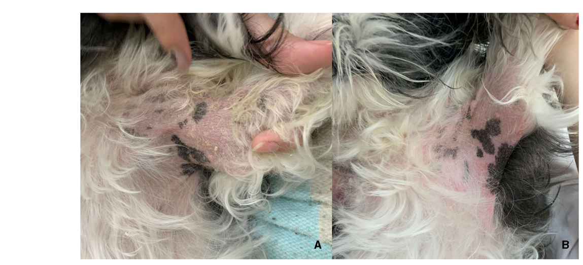
FIGURE 3 Axilla of a dog from the group treated with CBD-rich cannabis oil, before (A) and after (B) 60 days of treatment. Notice the reduction of erythema and absence of scaling in (B).

hyperpigmentation, crusting, and seborrhea (1). Luz-Veiga et al. (9) suggest that phytocannabinoids CBD and CBG have promising antimicrobial effects when topically Applied, without altering the