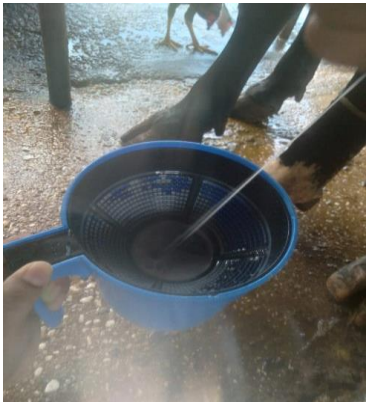
Figure 1. The black background mug test.

The animals from both farms were subjected to the two main field tests, non-laboratory-based, to indicate abnormalities in the mammary gland. Both farms were visited in the spring, when milk samples were obtained during milking (Figure 1), to be later examined under the black background mug test. The objective was to verify if there would be changes in the milk, such as the presence of lumps, blood and pus.