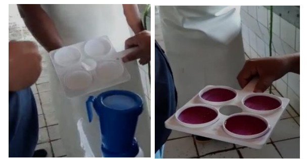
Figure 2 . California mastitis test, a) individuality sampling by ceiling, b) reaction reading.

After that, milk jets were collected with a racket for the California Mastitis Test. For each mammary quarter, 2 milliliters of a reagent were added, under circular movements for 20 seconds. Then, it was checked if the formation of gel occurred, with a reduction in the fluidity of the samples. Each mammary gland of each cow was classified as 0, +, ++ or +++ (Barnum and Newbould, 1961), Figure 2.