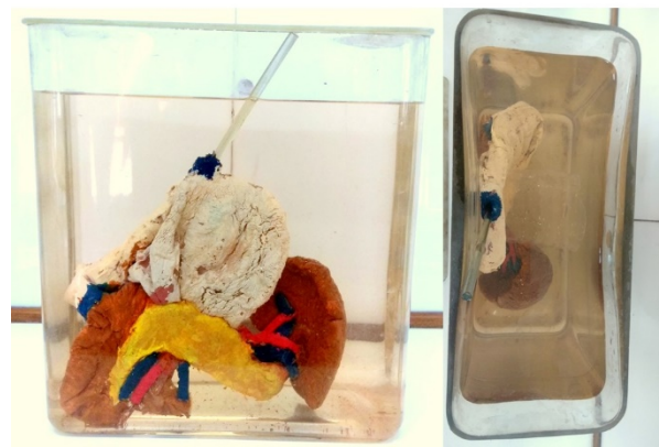
Figure 3: Figure showing relation of stomach, duodenum, pancreas & spleen and its mounting technique with plastic bottle