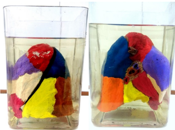
Figure 5: Figure showing Bronchopulmonary segment of left lungs