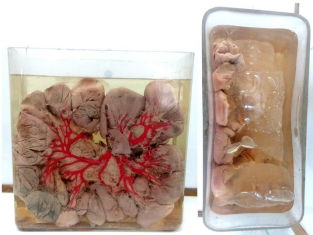
Figure 4: figure showing jejunal & ileal branch of mesenteric arteries with its mounting technique with plastic bottle