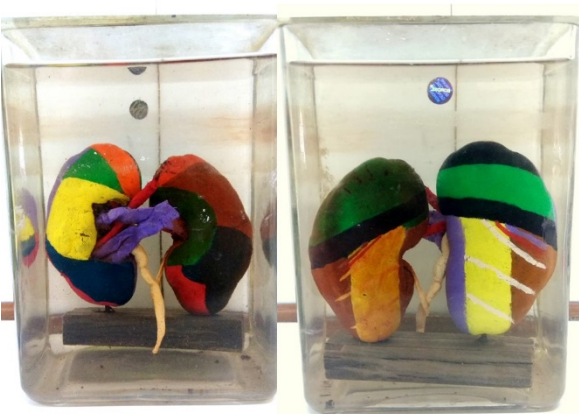
Figure 6: Figure showing anterior and posterior relation of right & left kidney and mounted with nail inserted in wood