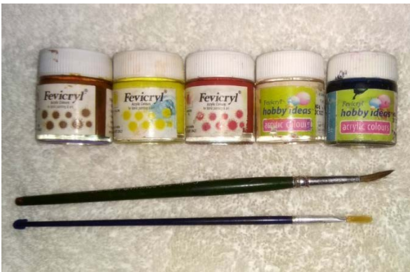
Figure 1: Figure showing acrylic paints with brushes

The creation of extraordinary museum specimen is only possible after proper planning of color and proper mounting for the presentation of the specimen without damaging. The five-step technique that we have used for coloring the various structure of abdominal and thorax region specimen were painted with anatomically correct color as mentioned in atlas and specimen were preserved in 10% formalin which was mounted with clear plastic bottles as shown in figure 3 and 4. No leakage, mixing of color was observed for six months with acrylic paint coated with clear nail polish to small structure and impression, since the materials used were nontoxic, commercially easily available in the stationary shop, and easy to handle. The coloring technique of wet specimen makes better understanding of the gross features and adding clear nail polish brings glistening effect to specimen and relations of the structure can be studied.