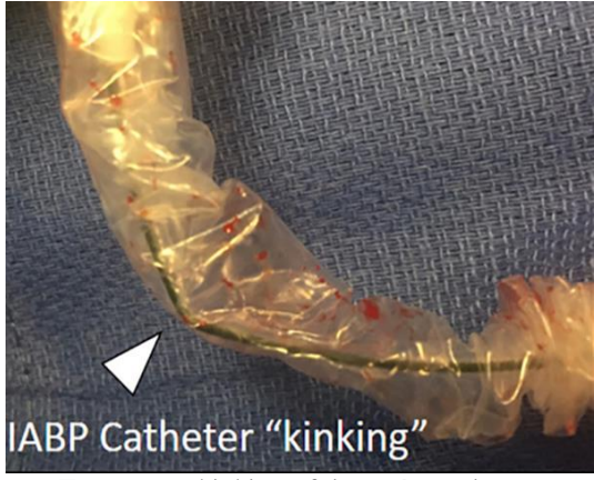
Figure (3): kinking of the IABP catheter

The IABP catheter's tip rarely perforates the aorta, unless it is positioned in the aortic arch. Placement of the IABP catheter was simple and done correctly under fluoroscopic guidance.