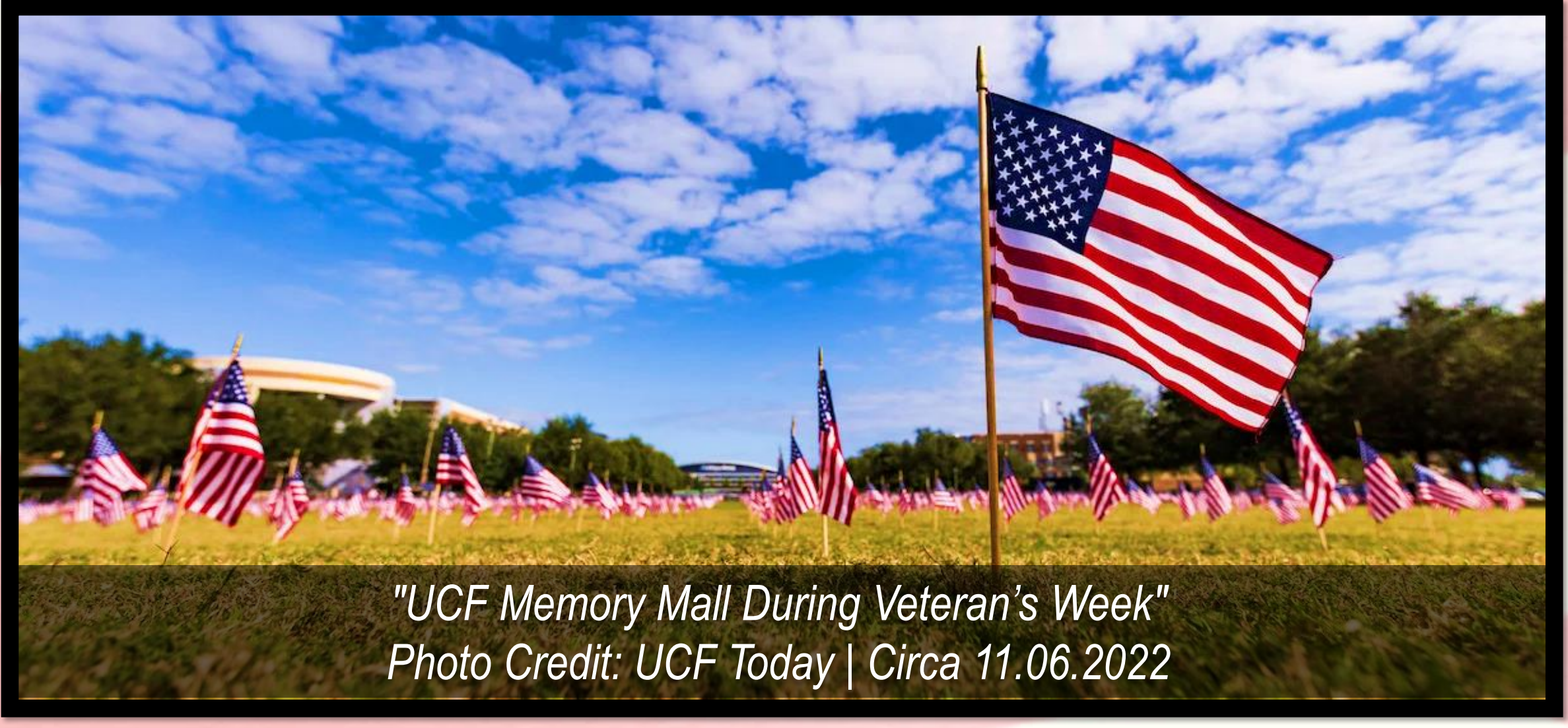
"UCF Memory Mall During Veteran's Week" | Circa 11.06.2022