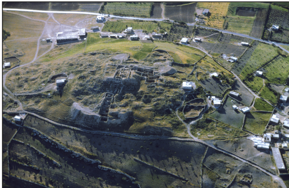
Aerial View of Tall Hisban.